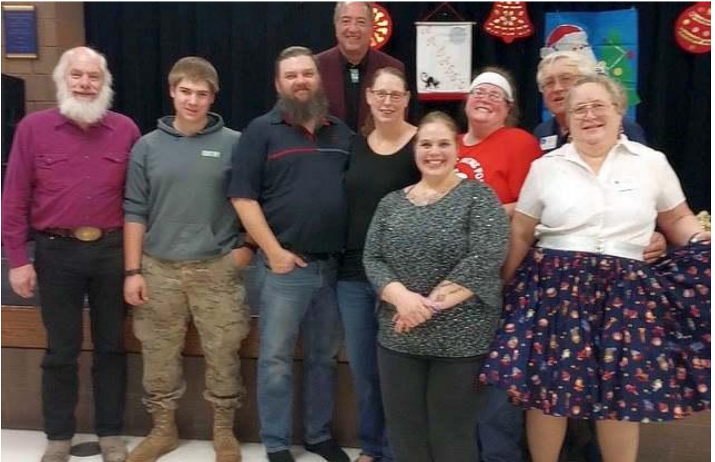
Lake Promenaders took a banner

Thank you for coming to our Hotfoot Christmas dance. All of you dancers made it a very special Christmas dance