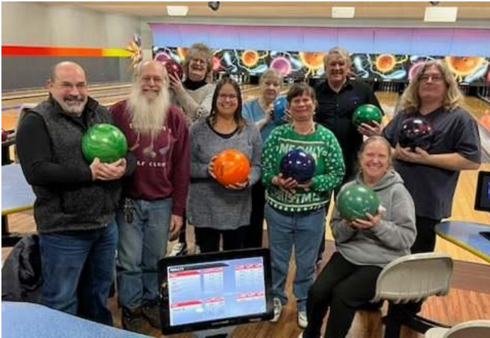
Hotfoot bowlers had a “ball” Sunday December 3 rd