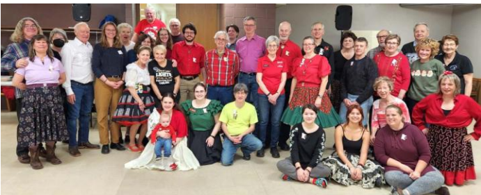
Hotfoot earns a triple size banner at Dan's Pac Chili Feed dance 12-16-23