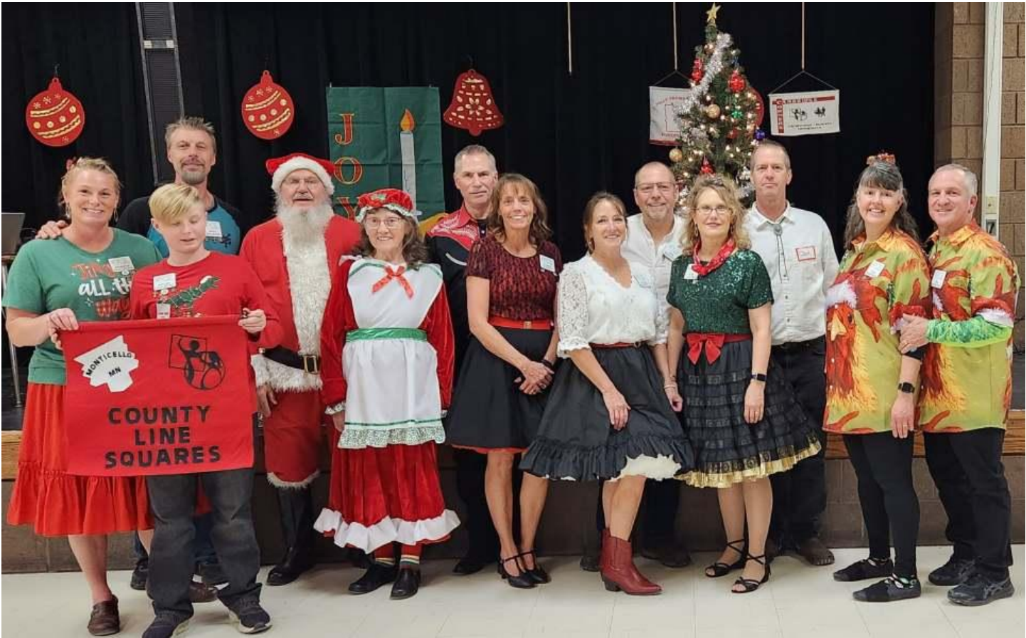
County Line retrieved their banner