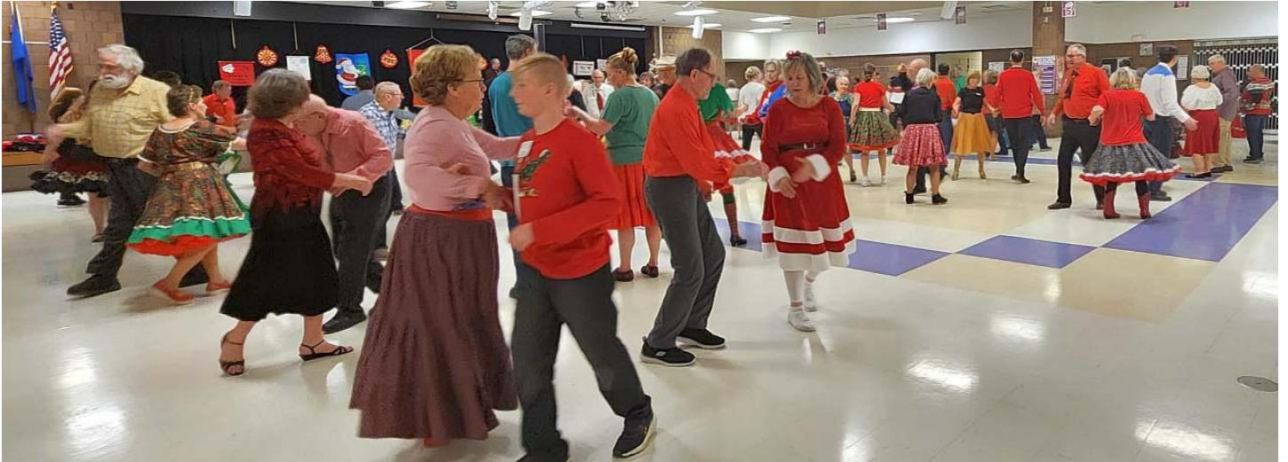
Northdale Middle School was hopping that night