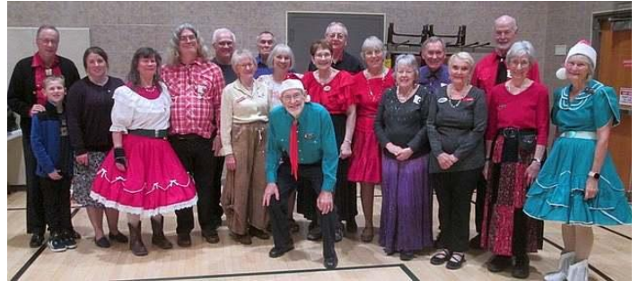
No banner to Hotfoot from Gospel Plus 12-22-23 It was a banner turnout though