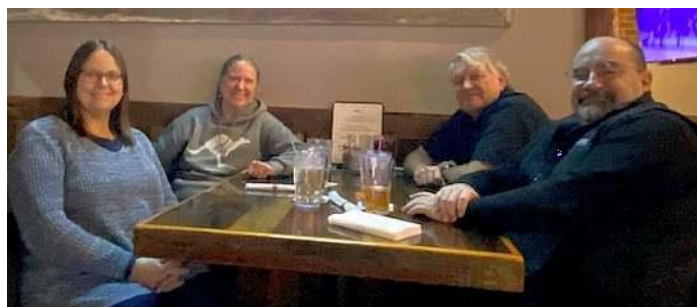
Hotfoot’s Social Organizers 12-3-23