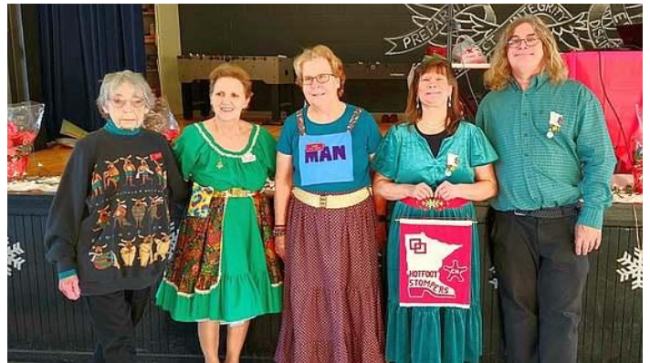
Hotfoot nailed a banner from Westonka 12-28-23