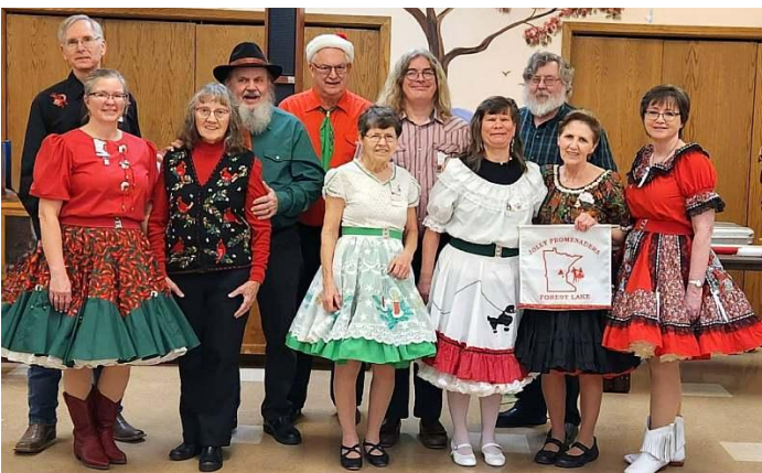
Jolly Promenaders' loses a small banner to Hotfoot 12-16-23