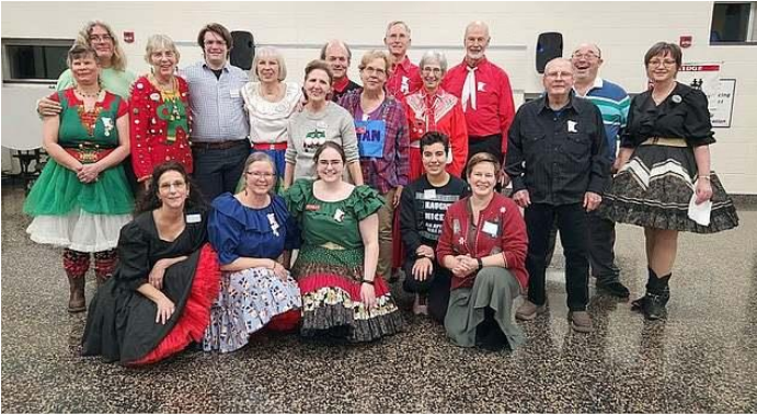
Hotfoot earns banner at Cambridge Corners 12-1-23