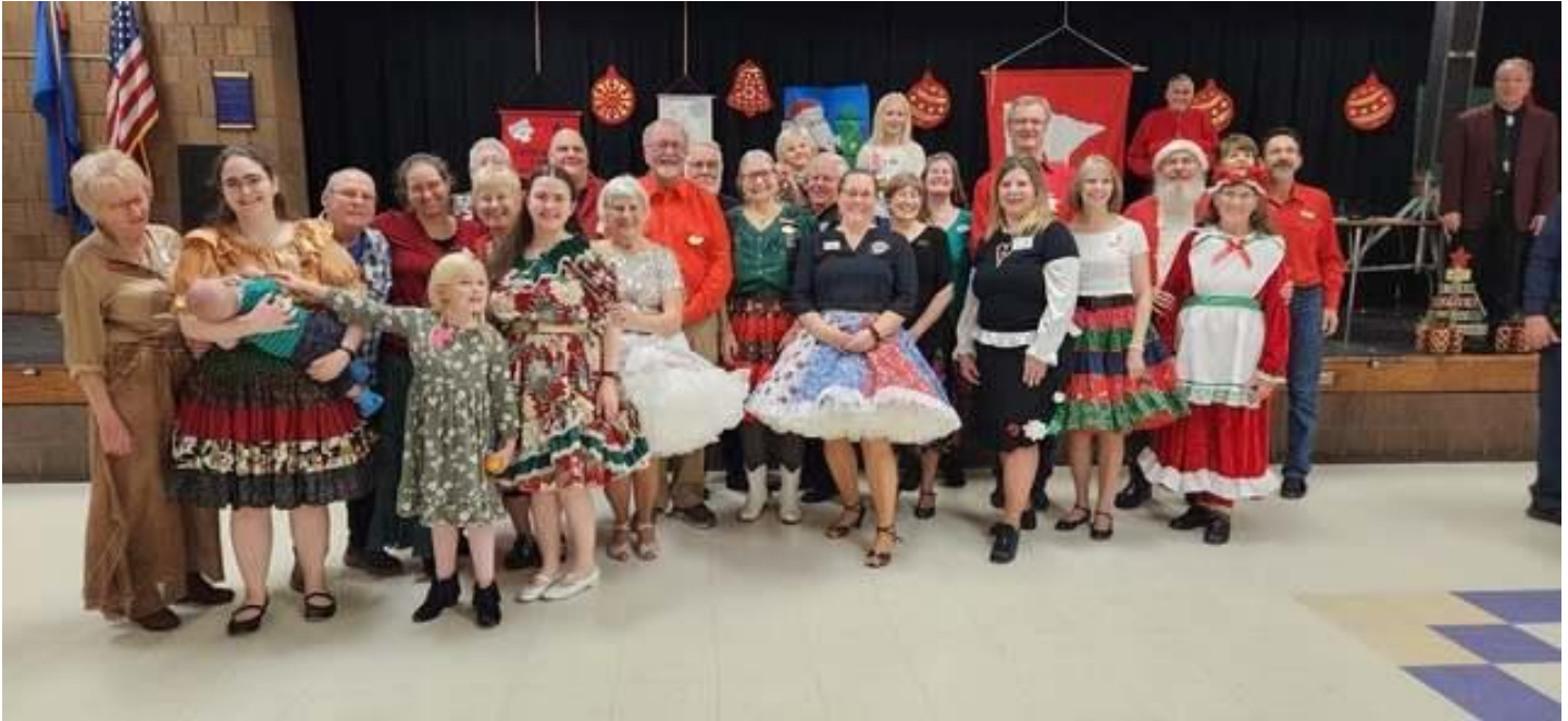
Dan'se Pac took a banner