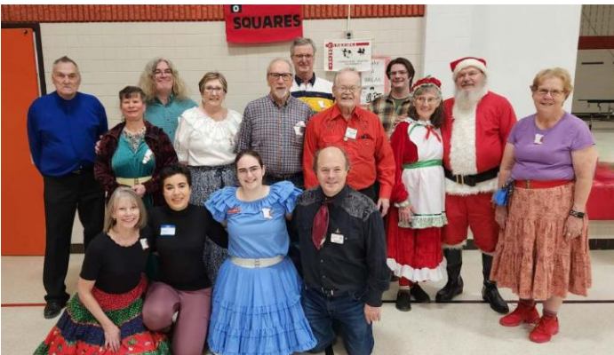
County Line loses a banner to Hotfoot 12-8-23