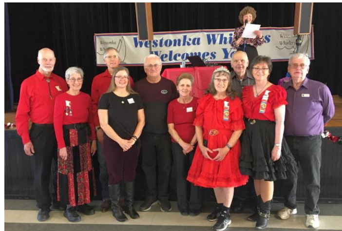
Banner Retrieval at Westonka 2-20-22