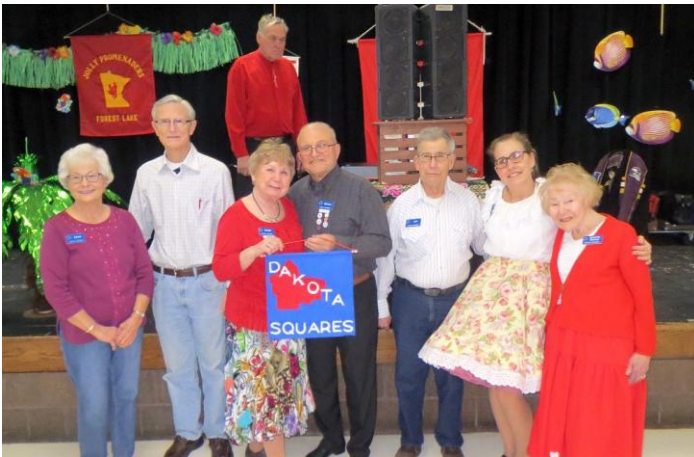
It looks like Dakota Squares didn't waste any time getting their banner back