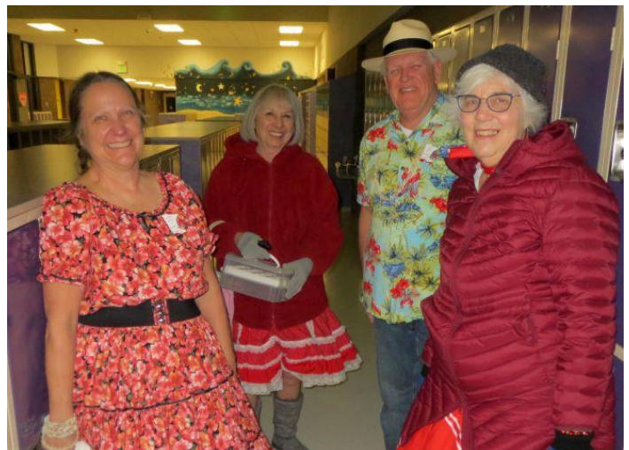
De-greeters after the dance