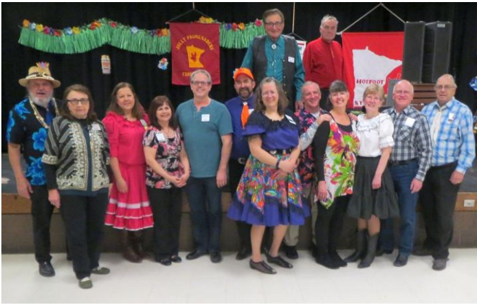
County Line gets a banner