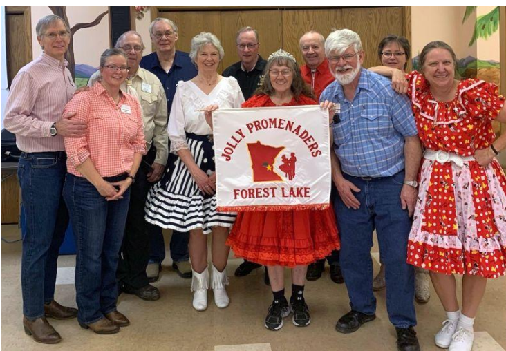
Banner Raid to Jolly Promenaders 2-19-22