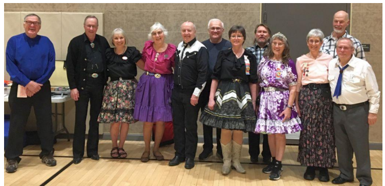
A non-banner run to Gospel PLUS 2-25-22