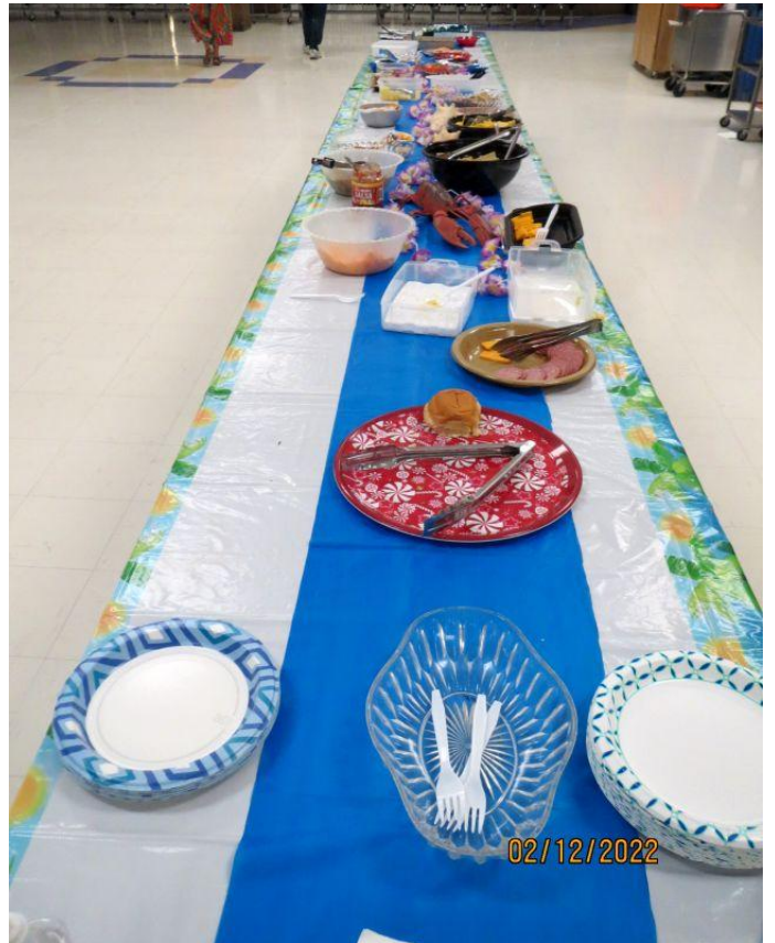
After the crowd has eaten