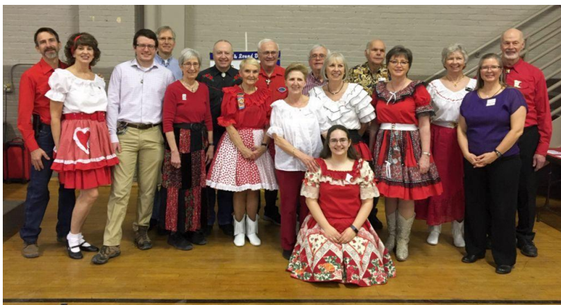
Banner Raid to ArDales 2-13-22