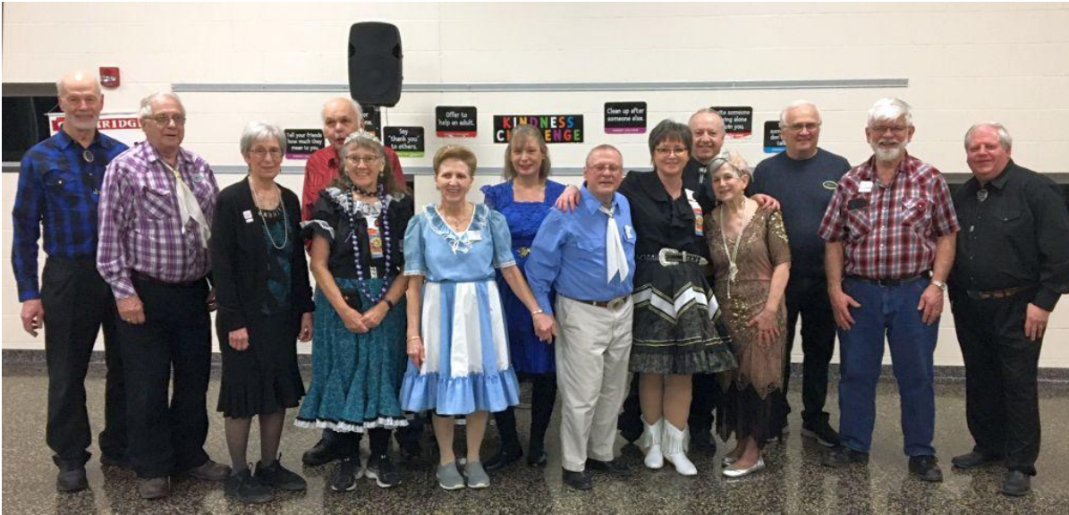
Banner Raid to Cambridge Corners 2-4-22