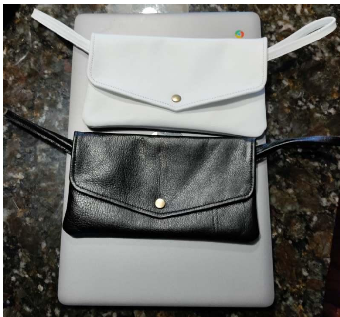
These were requested to be able to hold Sheila's cell phone so Sharon accommodated her request