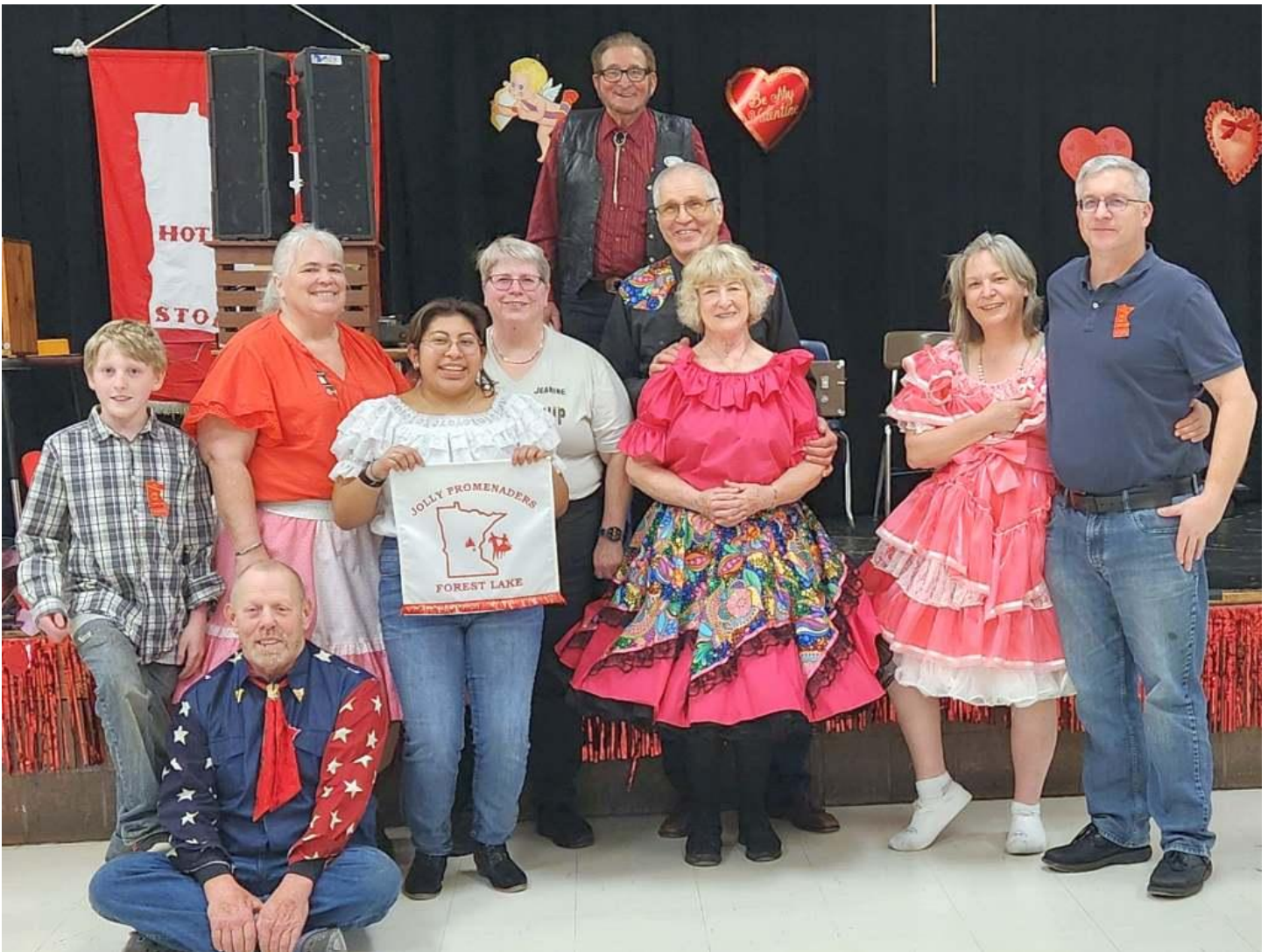
And Jolly Promenaders retrieved their banner – they're happy, too