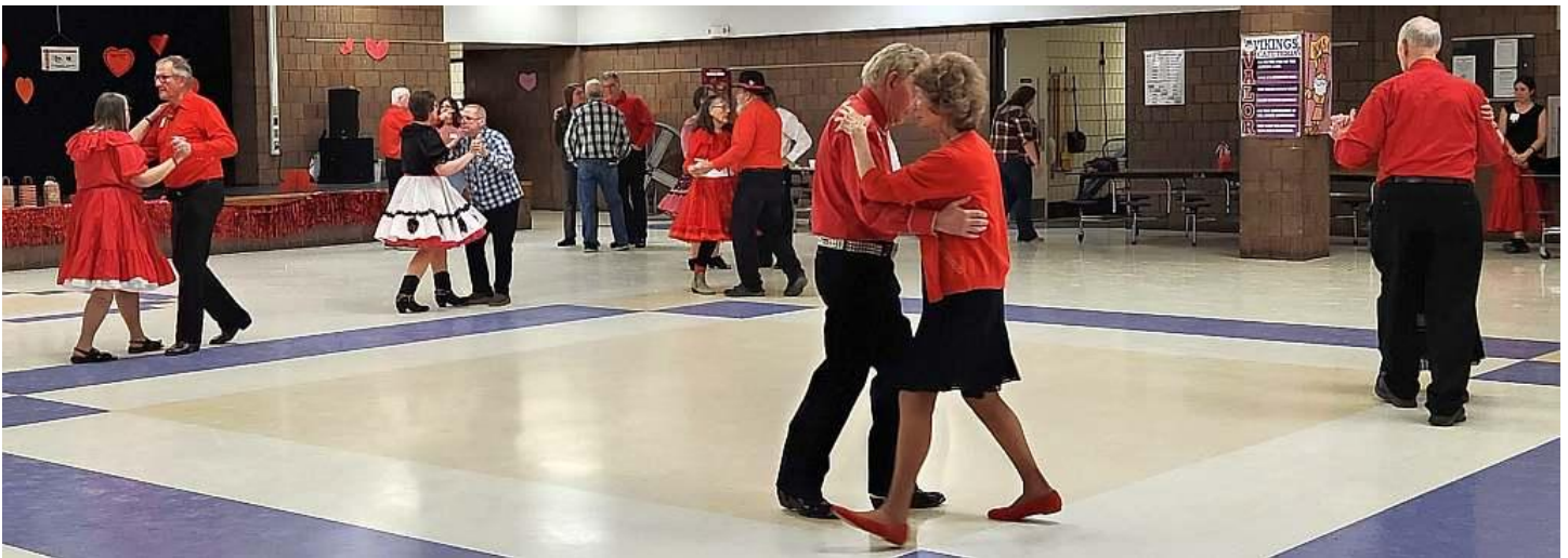
Rounding out the evening