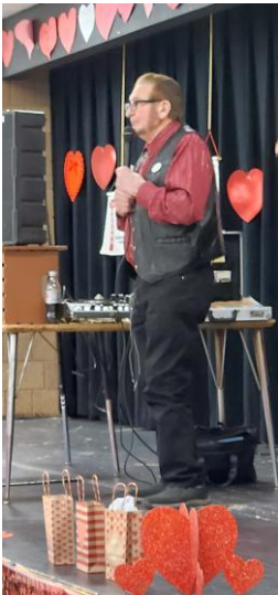
Abe calls fun