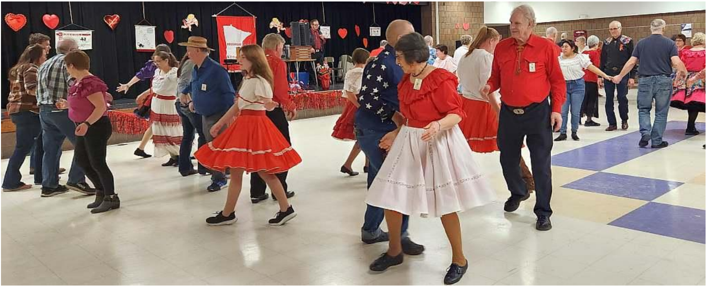
So much fun exercise