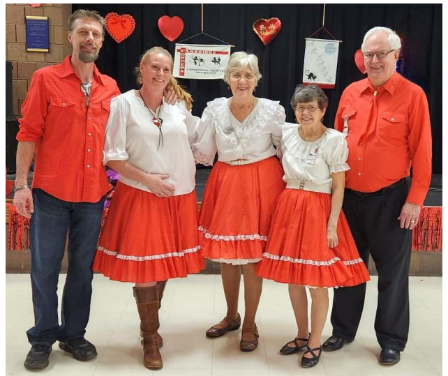
Self-explanatory photo capture