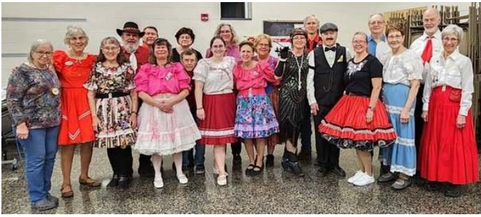
Hotfoot at Guys & Dolls Cambridge Corners 2-2-24