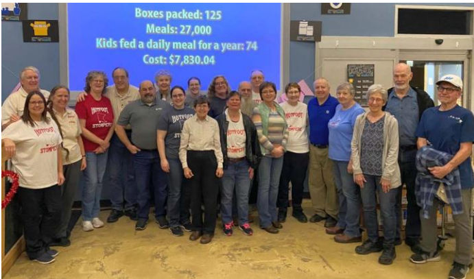
Hotfoot knows how to pack 'em in 2-6-24