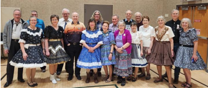
Hotfoot at Gospel Plus 2-23-24