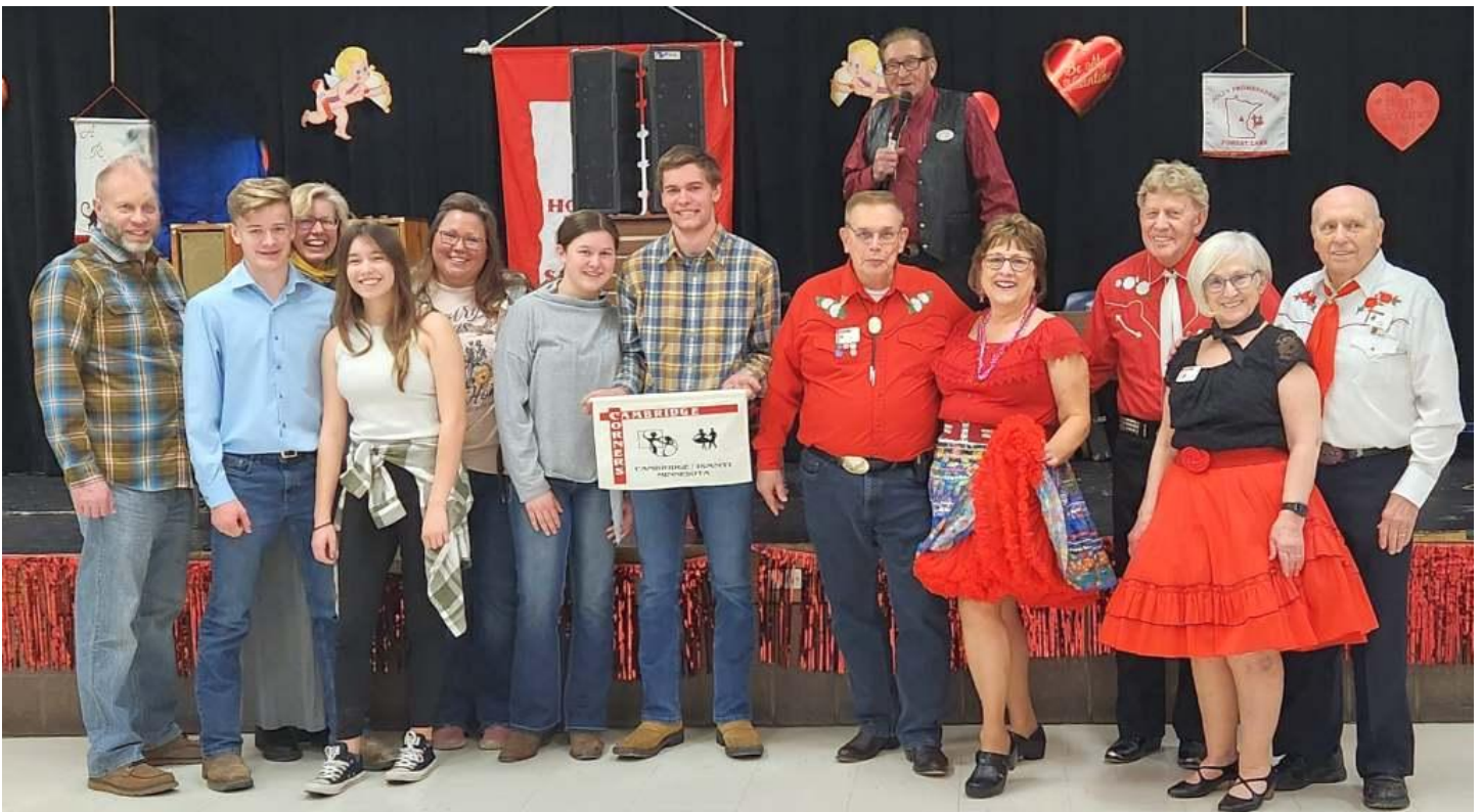
Cambridge Corners is happy to retrieve their banner