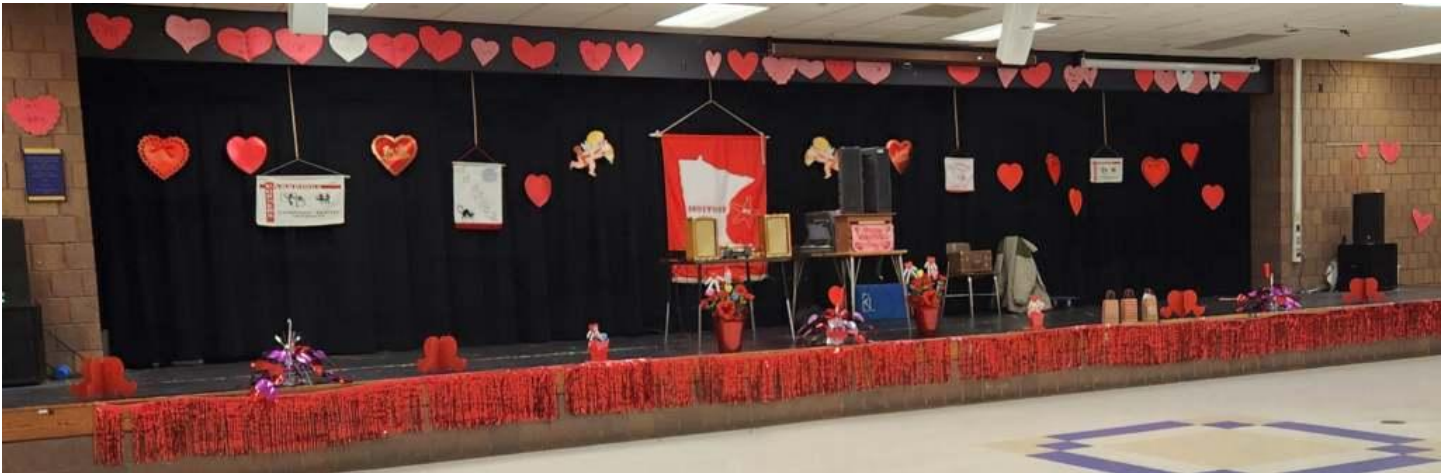
Hotfoot's Decorating Committee makes our themes come alive

Thanks to all who came and made the evening memorable, especially to our volunteers who step up and put everyone else ahead of their own dance time.