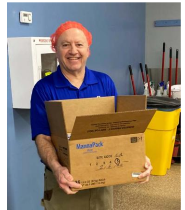
Les tries to keep up