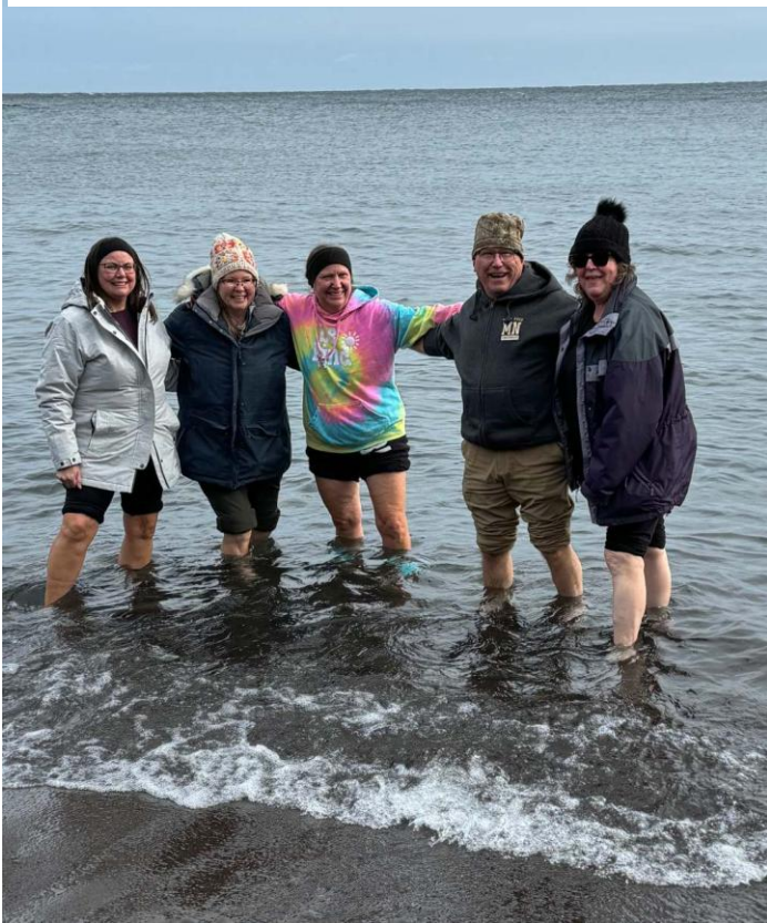
Lake Superior is always a fun place 2-17-24