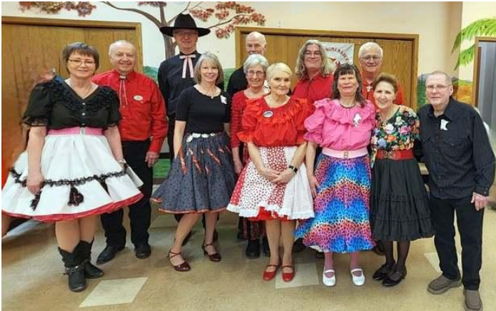
Hotfoot earns banner at Jolly Promenaders 2-17-24