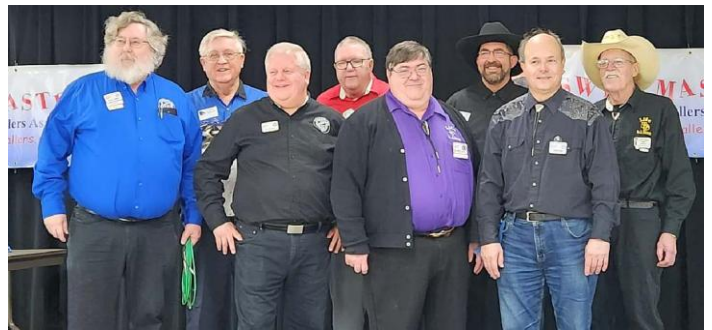
Swingmasters' callers at Northdale Middle School for MidWinter Magic to warm up students 1-27-24