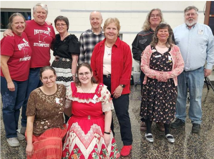
Hotfoot takes Cambridge Corners banner 2-7-25