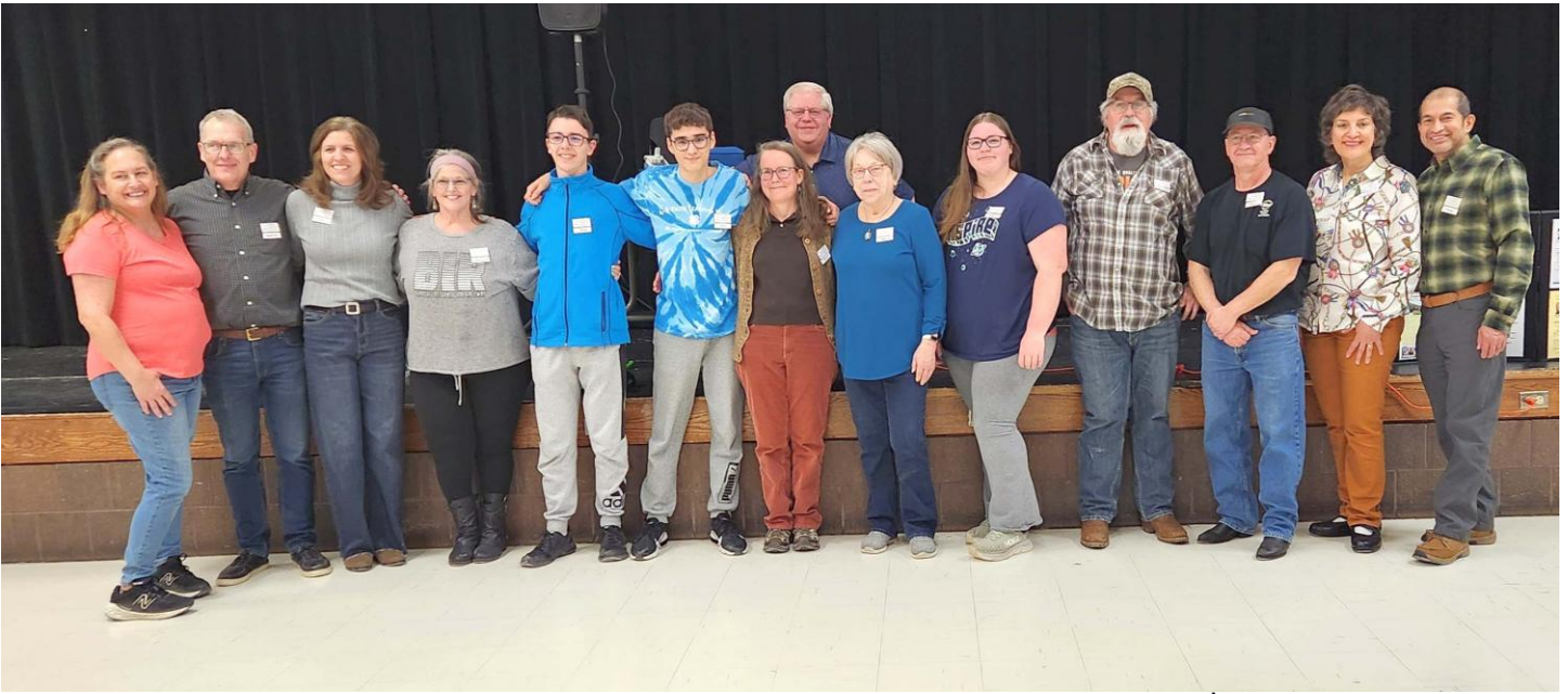
Thirteen Hotfoot Stompers' students ready to graduate on March 3 rd , 2025