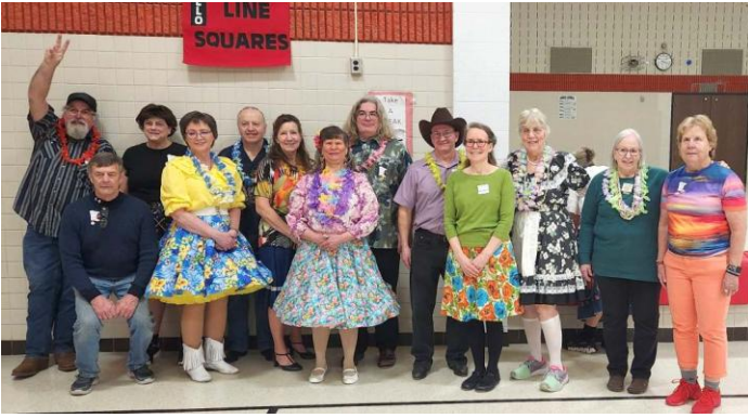
Hotfoot takes a banner from County Line 1-31-25