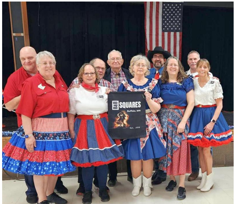
B & B Squares retrieves their banner