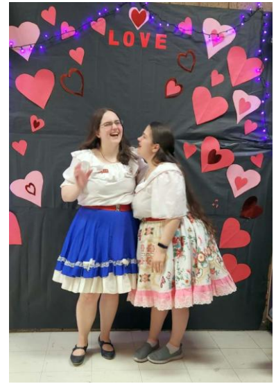
How cousins can relieve stress