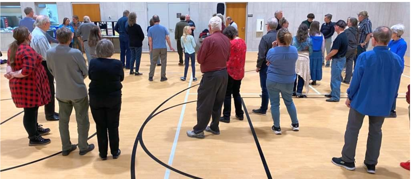
Hey everyone – look here for a picture - I guess it was announcement time at Monday night lessons at Faith Lutheran Church 2-17-25