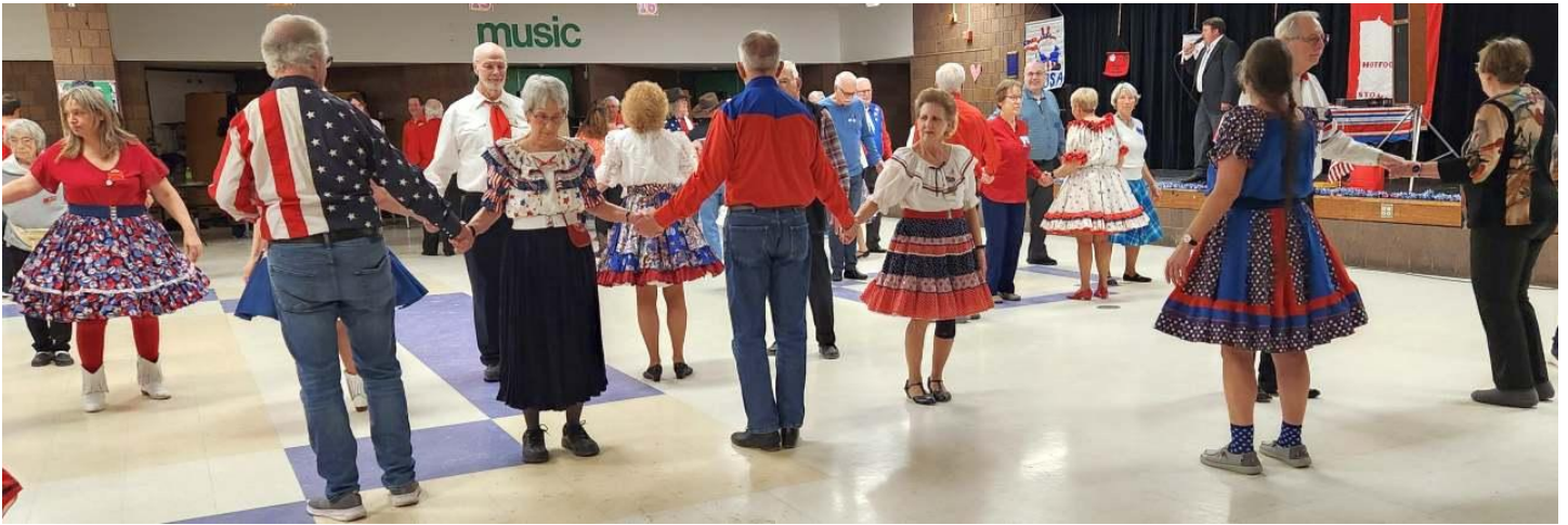
Gee, there sure seems to be a lot of red, white and blue tonight – oh that's our theme tonight