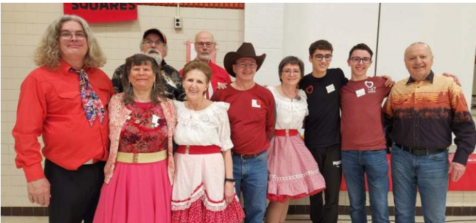
Hotfoot takes a banner from County Line 2-11-25