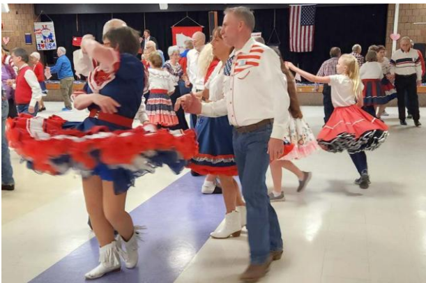
Wow, look at the fun