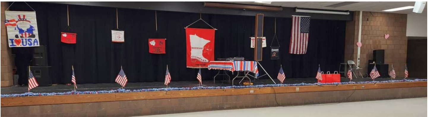
Stage is set up ready for some fun dancing