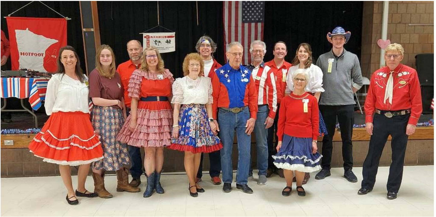
Cambridge Corners steals a Hotfoot banner