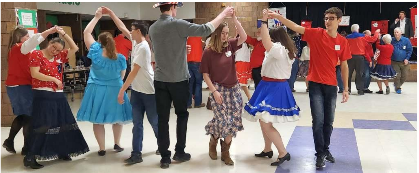
It's sure fun to see our youth enjoying square dancing - I remember when I was young .....