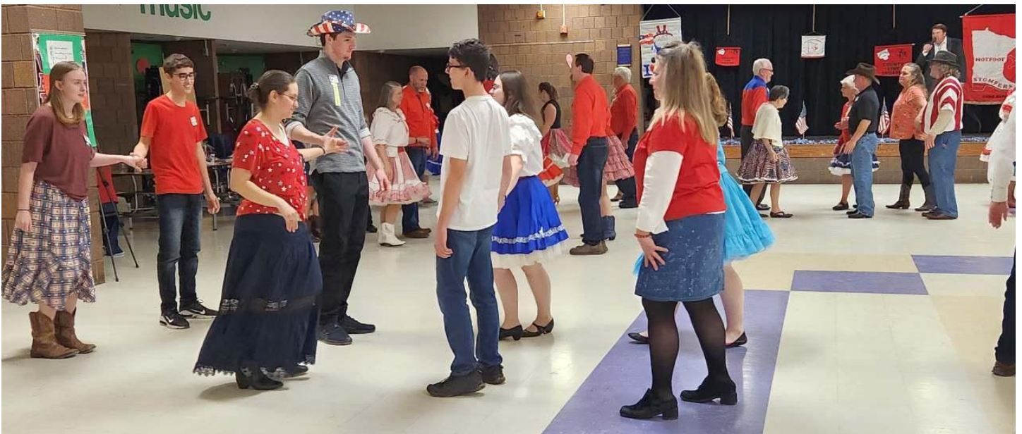
Students joined in and made the dance even more special