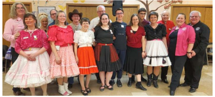
Hotfoot takes Jolly Promenaders banner 2-12-25