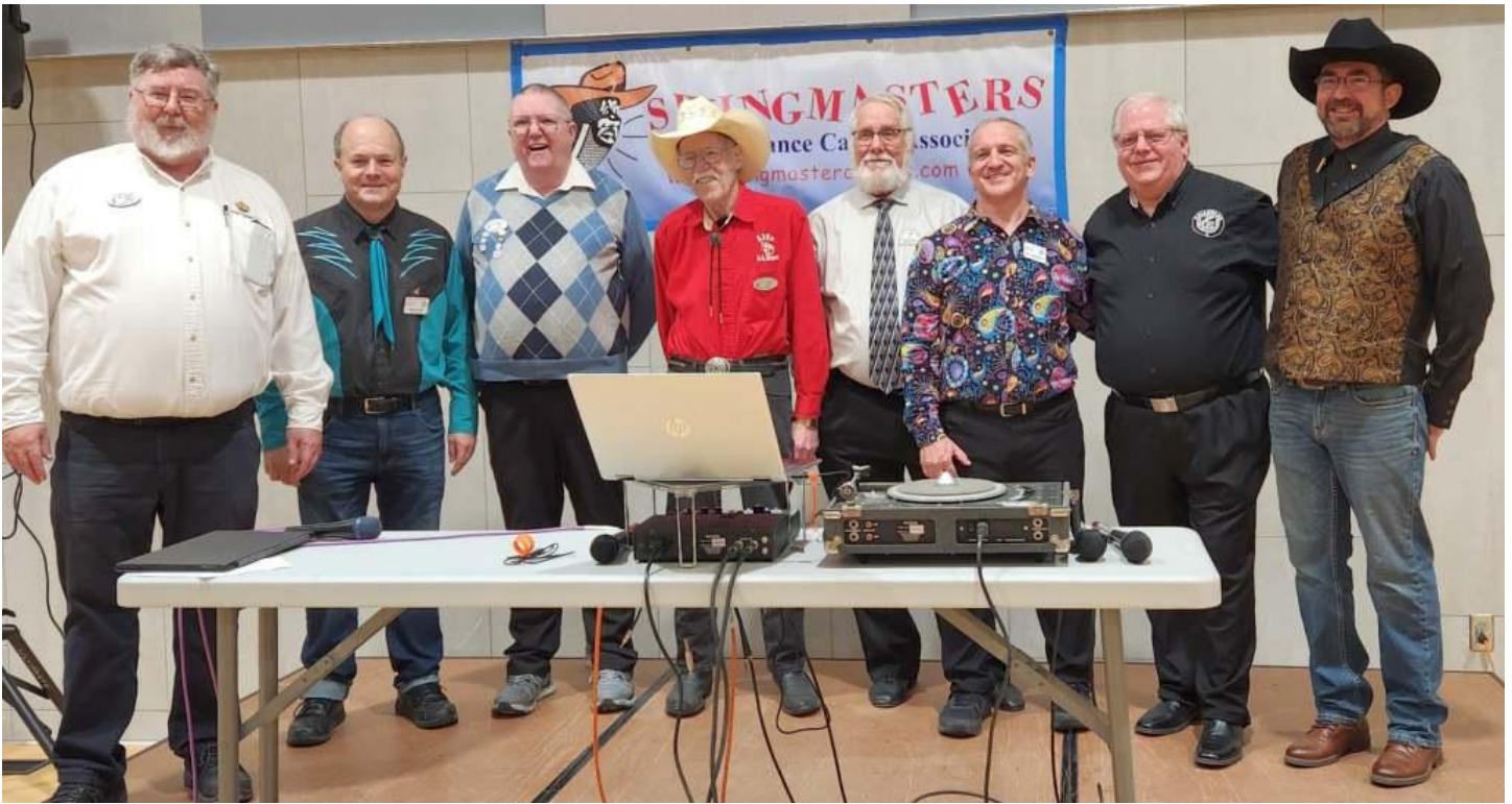
Faith Lutheran Church was the location for Mid Winter Magic this year