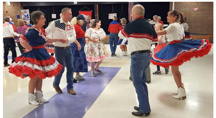
and more fun