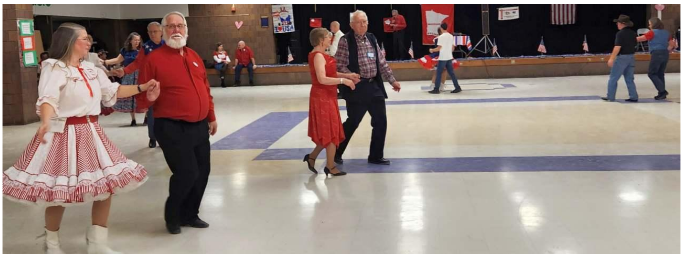
And some round dancing while square dancers enjoy the potluck