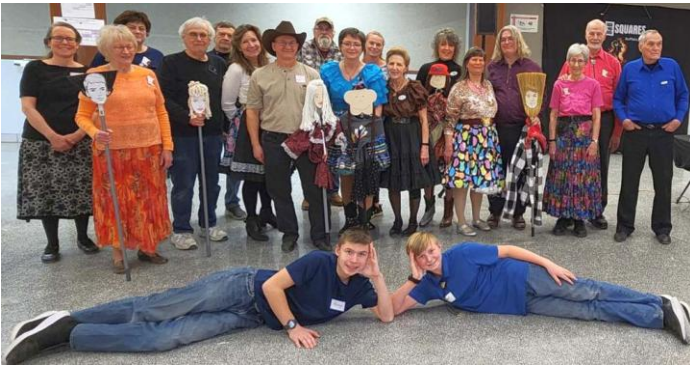
Hotfoot takes a banner from B&B Squares 2-1-25