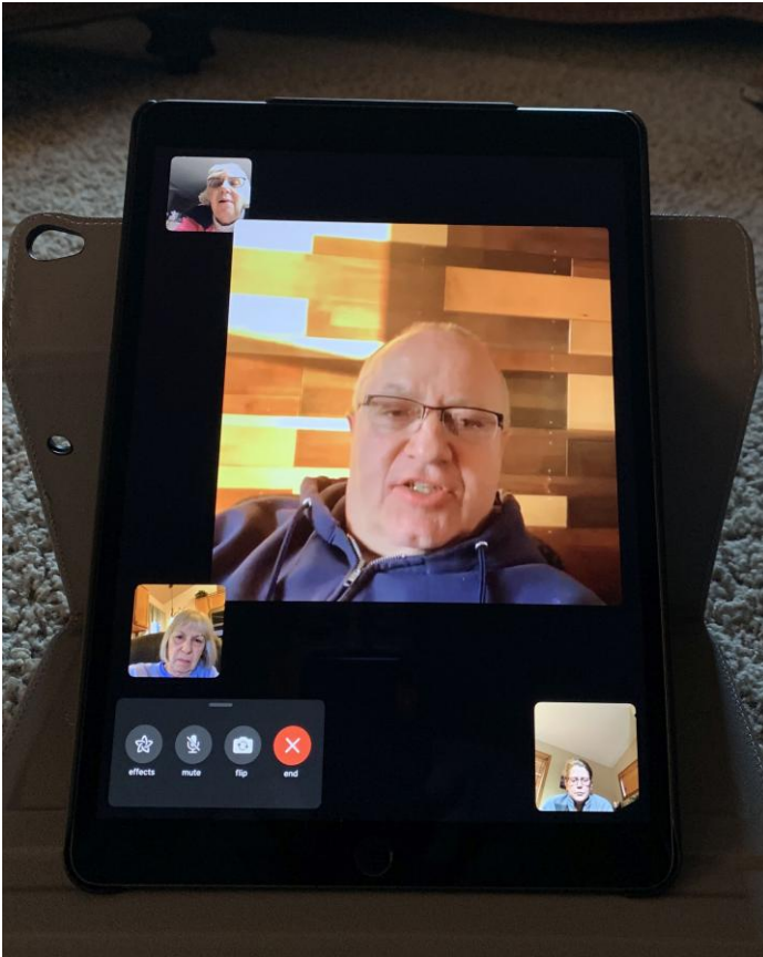
The 40th anniversary committee planning meeting

In these times of Social Distancing this is good advice.