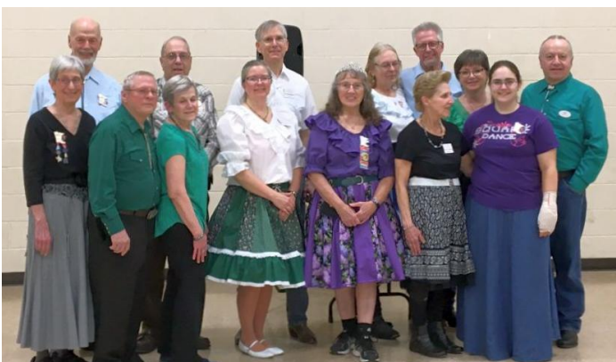
Dakota Grand 3-5-22