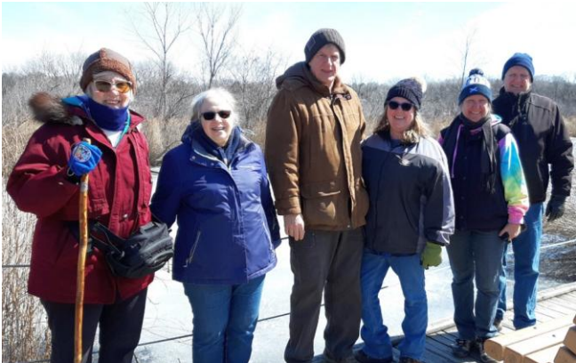
Mmmmmmmmmmm - Maple syrup tree tappers