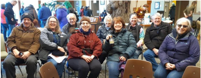
Social at Harriet Alexander Nature Center 3-27-22