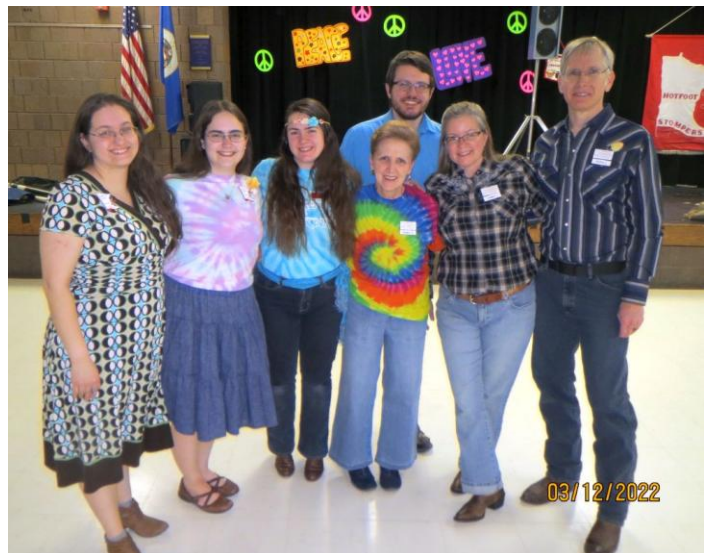
Student coordinators with students