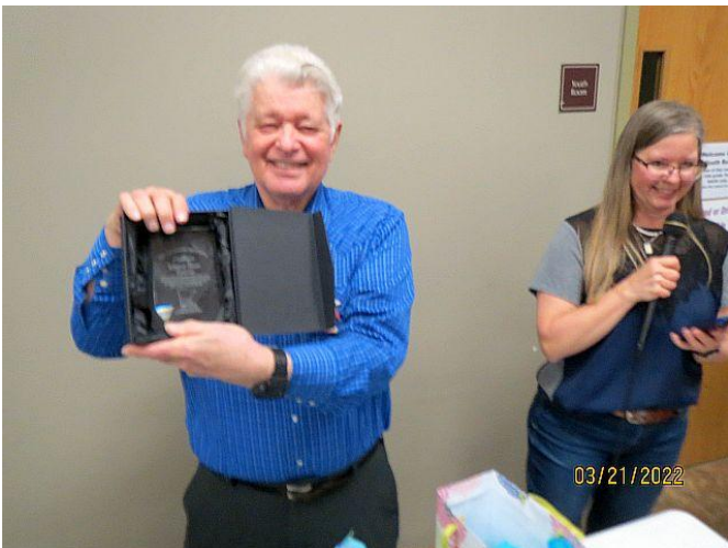
Wow – an Emmy award