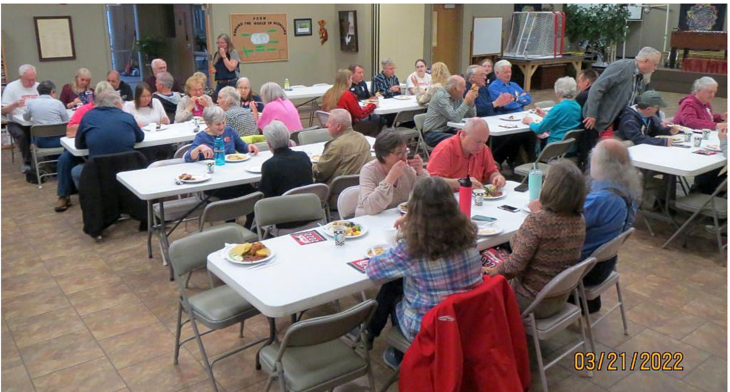
Potluck dinner before the test and special dance at PCOM