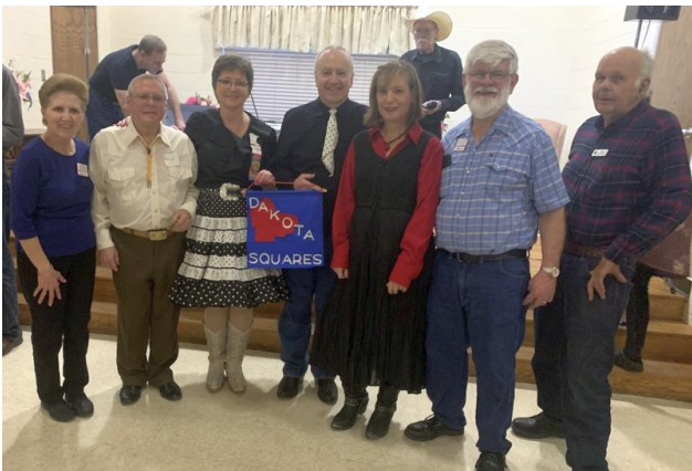
Hotfoot retrieves banner from Dakota Squares