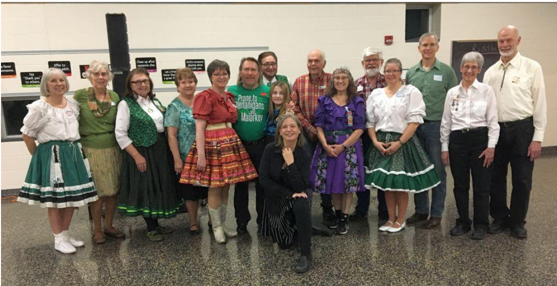
Cambridge Corners 3-4-22