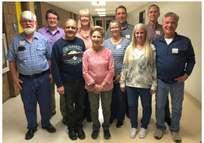
Anticipation one week before graduation

What could make square dancing Turing complete?