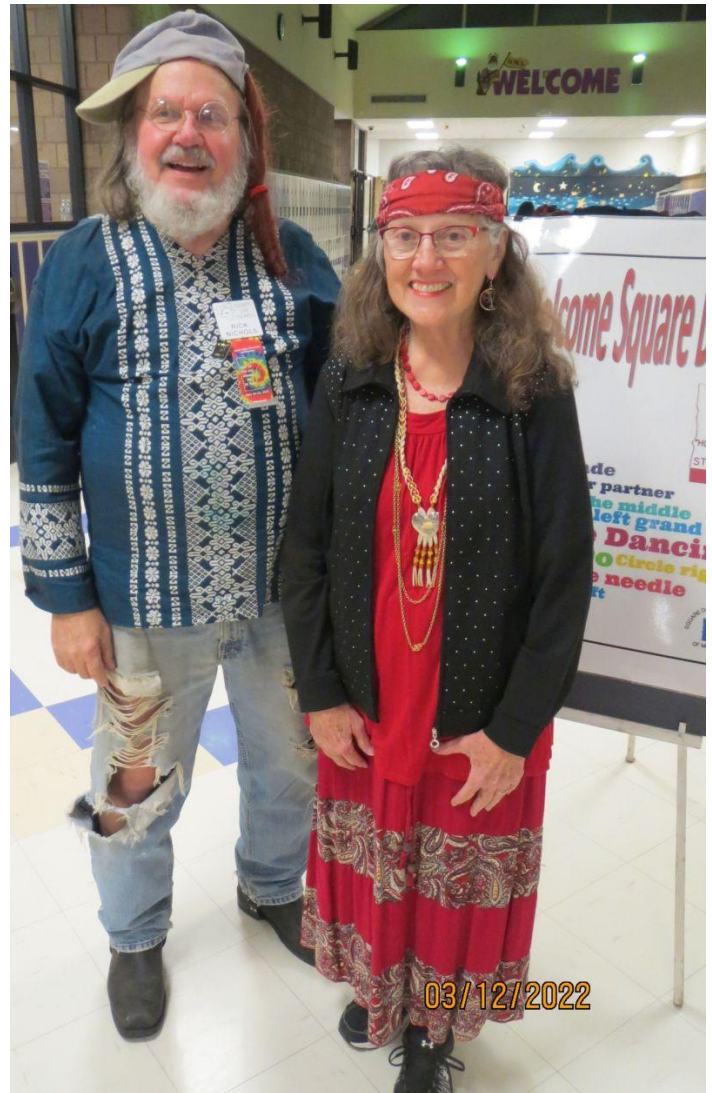
Greeting fellow “hippies” at Hotfoot March dance