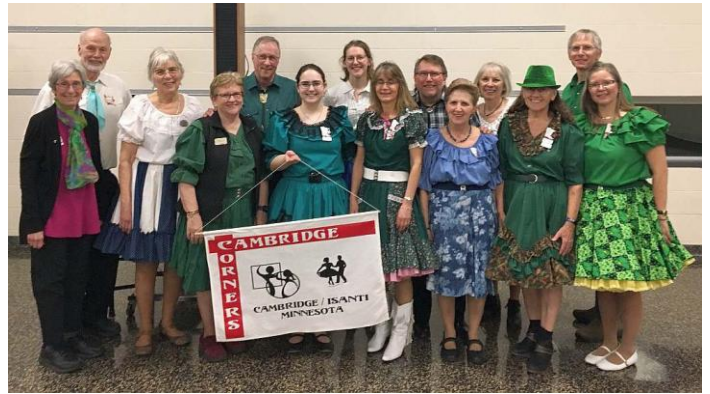
Large banner from Cambridge Corners 3-3-23