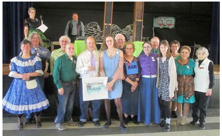
Hotfoot at Westonka Whirlers 3-18-23