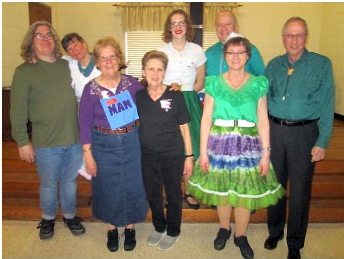
Hotfoot at Dakota Squares 3-26-23