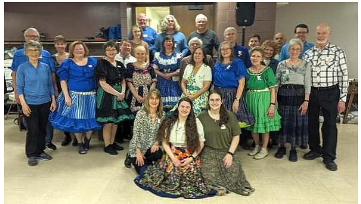
Hotfoot at Dan's Pop-Up Dance 3-4-23