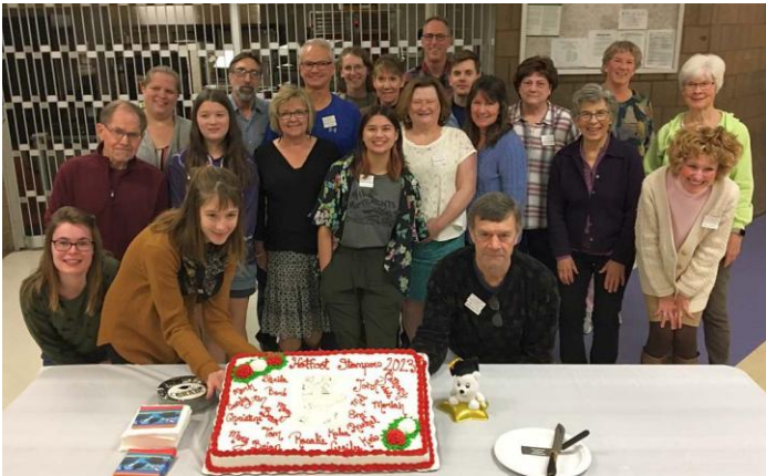
Students gather before potluck