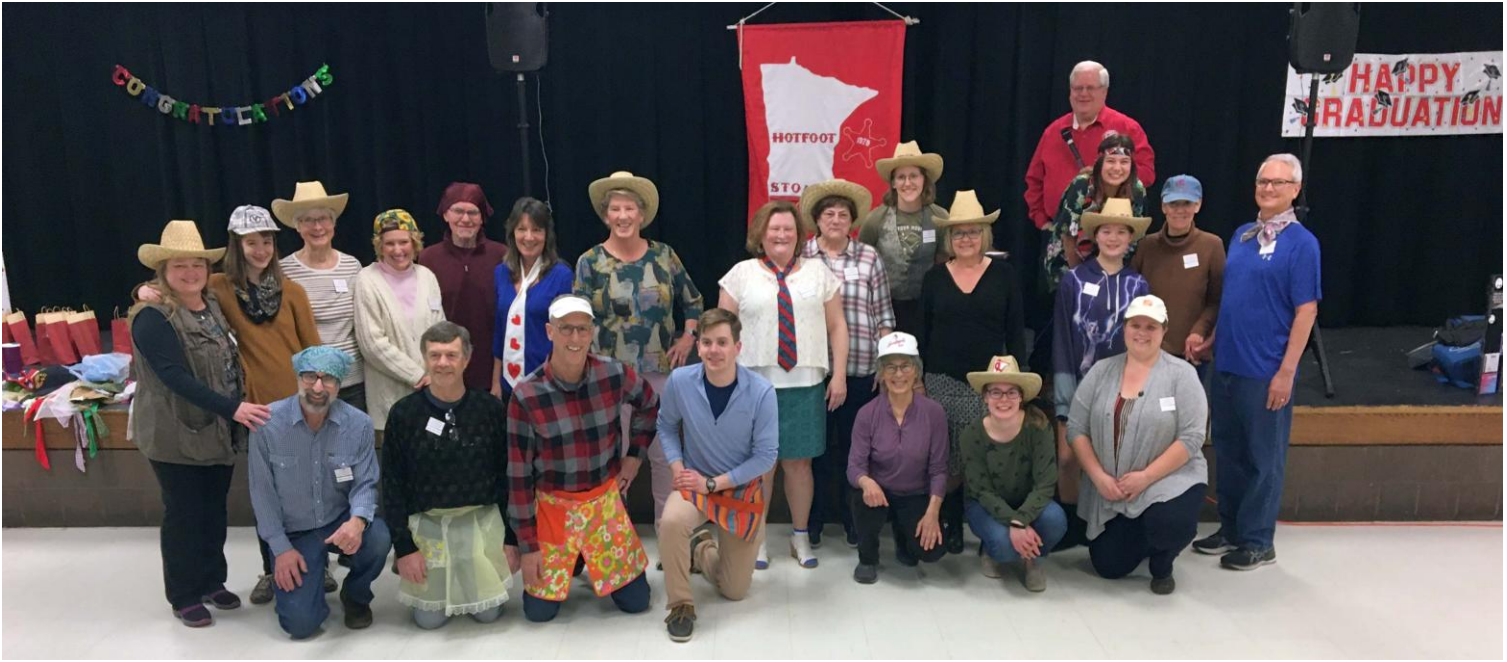
Congratulations new members