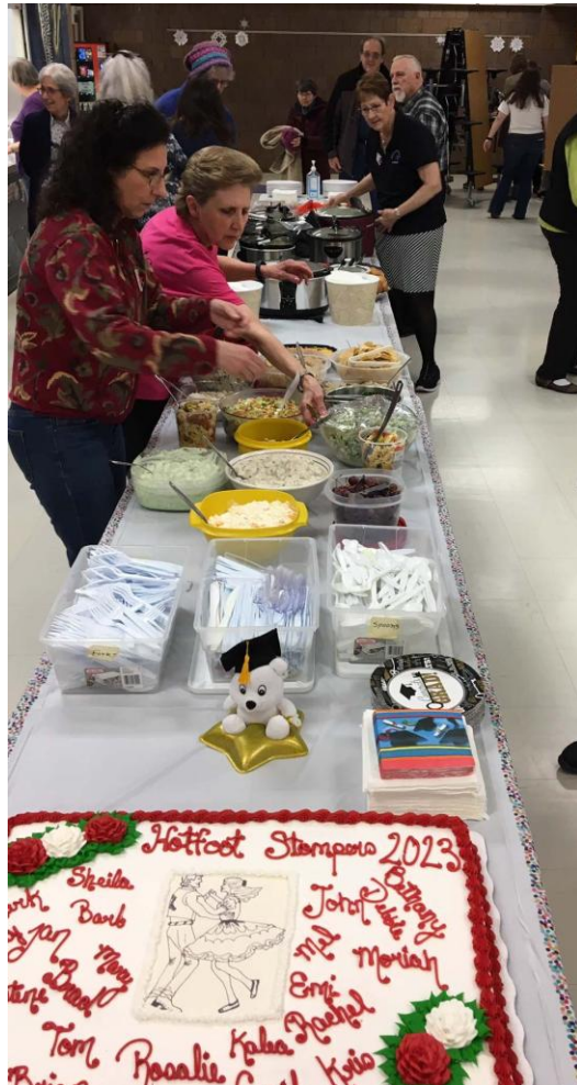
Preparing the potluck line for our students