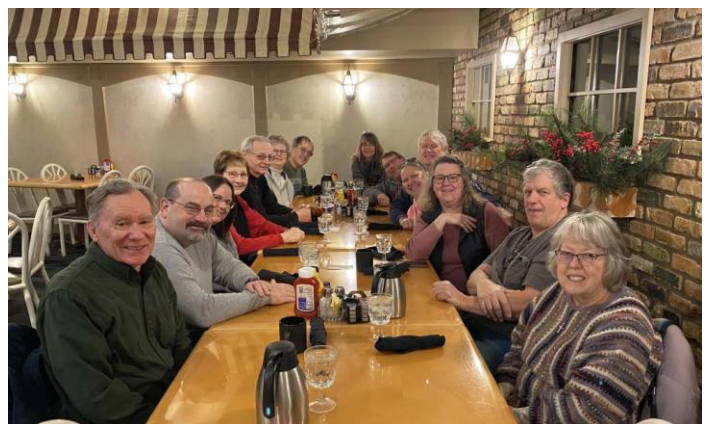
Hotfooters having fun and never going hungry