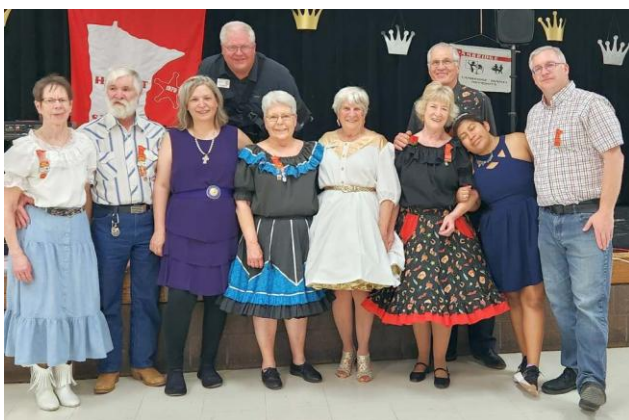
Jolly Promenaders took a banner