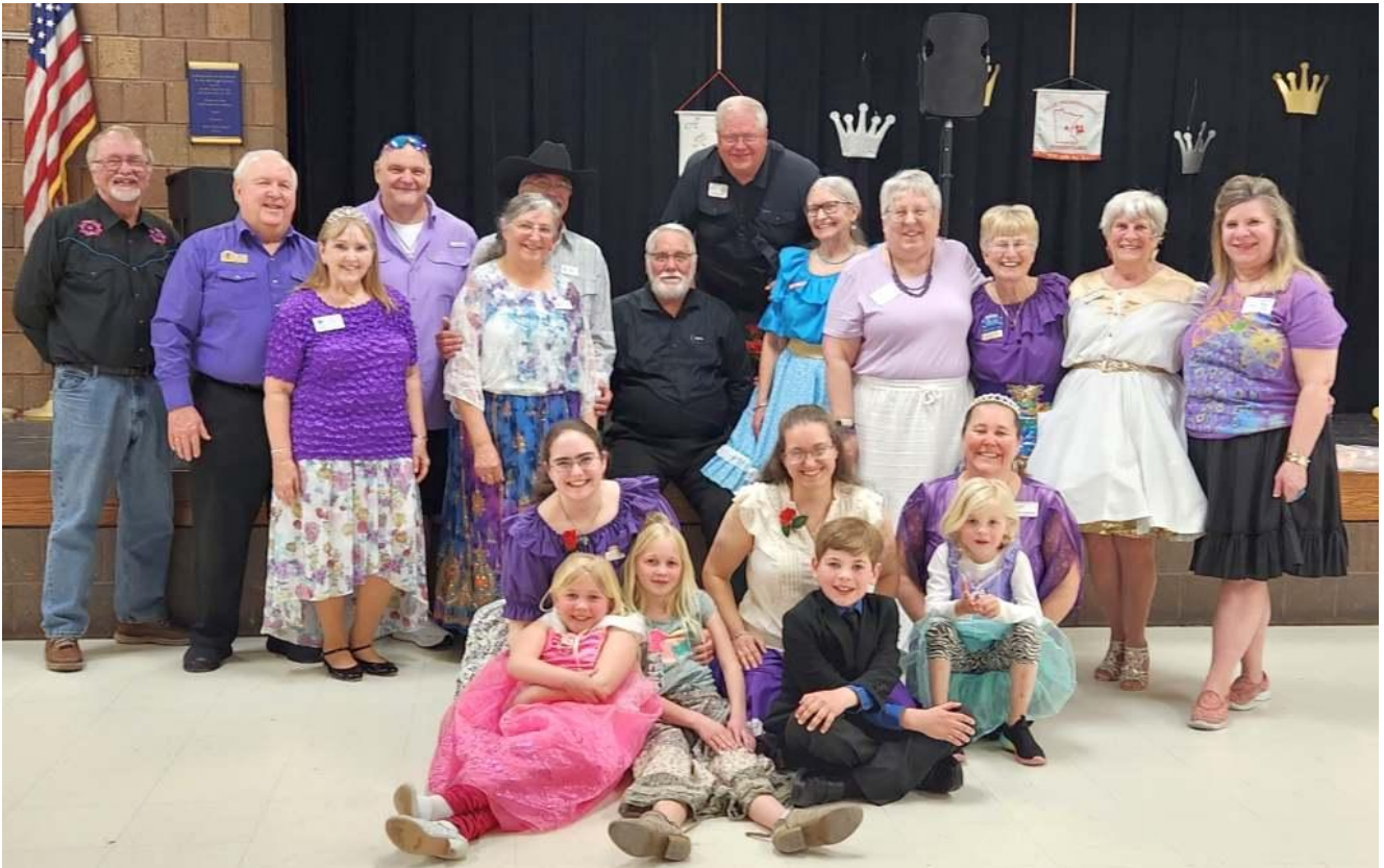
Dans'Pac took a banner