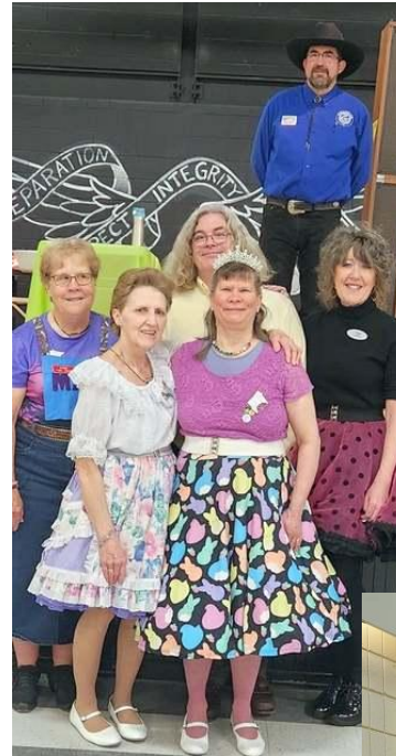
Hotfoot at Westonka 4-20-24