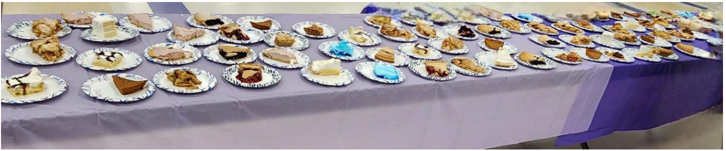
Now that's a lot of pie – where does it end? We needed some fast calling to wear those calories off, eh?