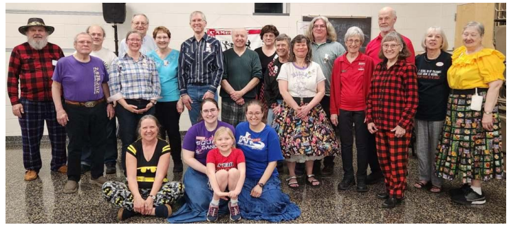
Hotfoot earns banner at Cambridge Corners 4-5-24