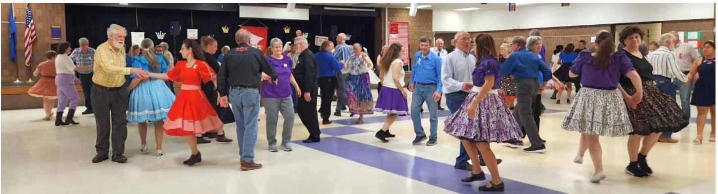
They square danced and square danced well