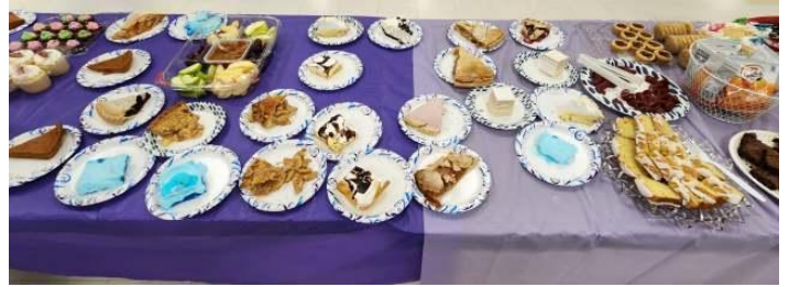
Did I mention that it was pie and ice cream Royalty Dance?