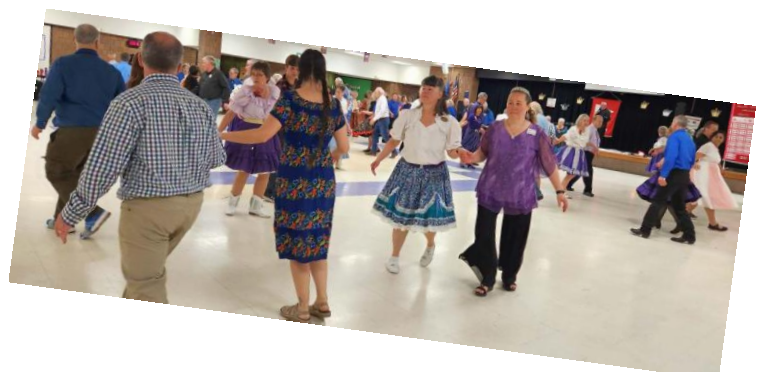
More square dancing