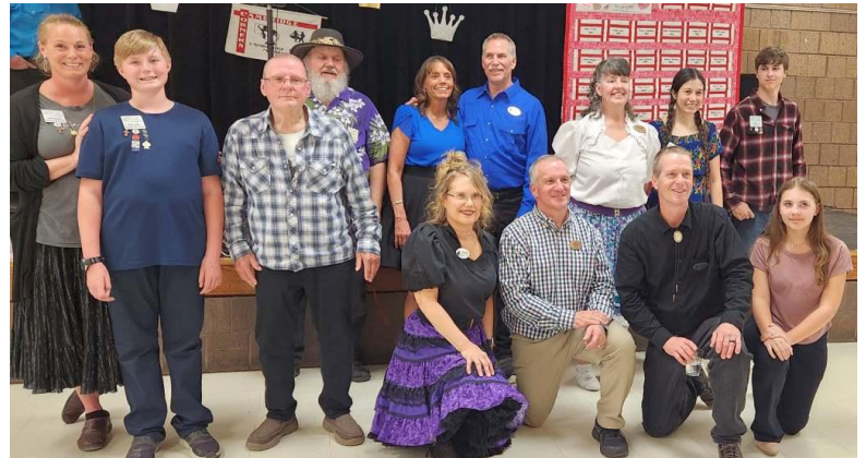
County Line took a banner