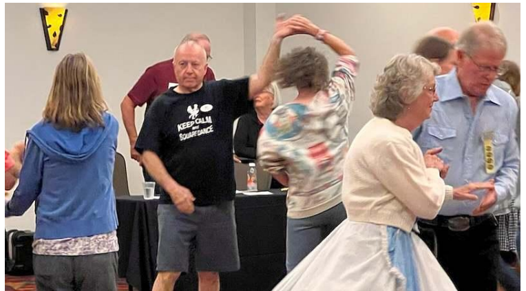
With Les, there's always a lot more