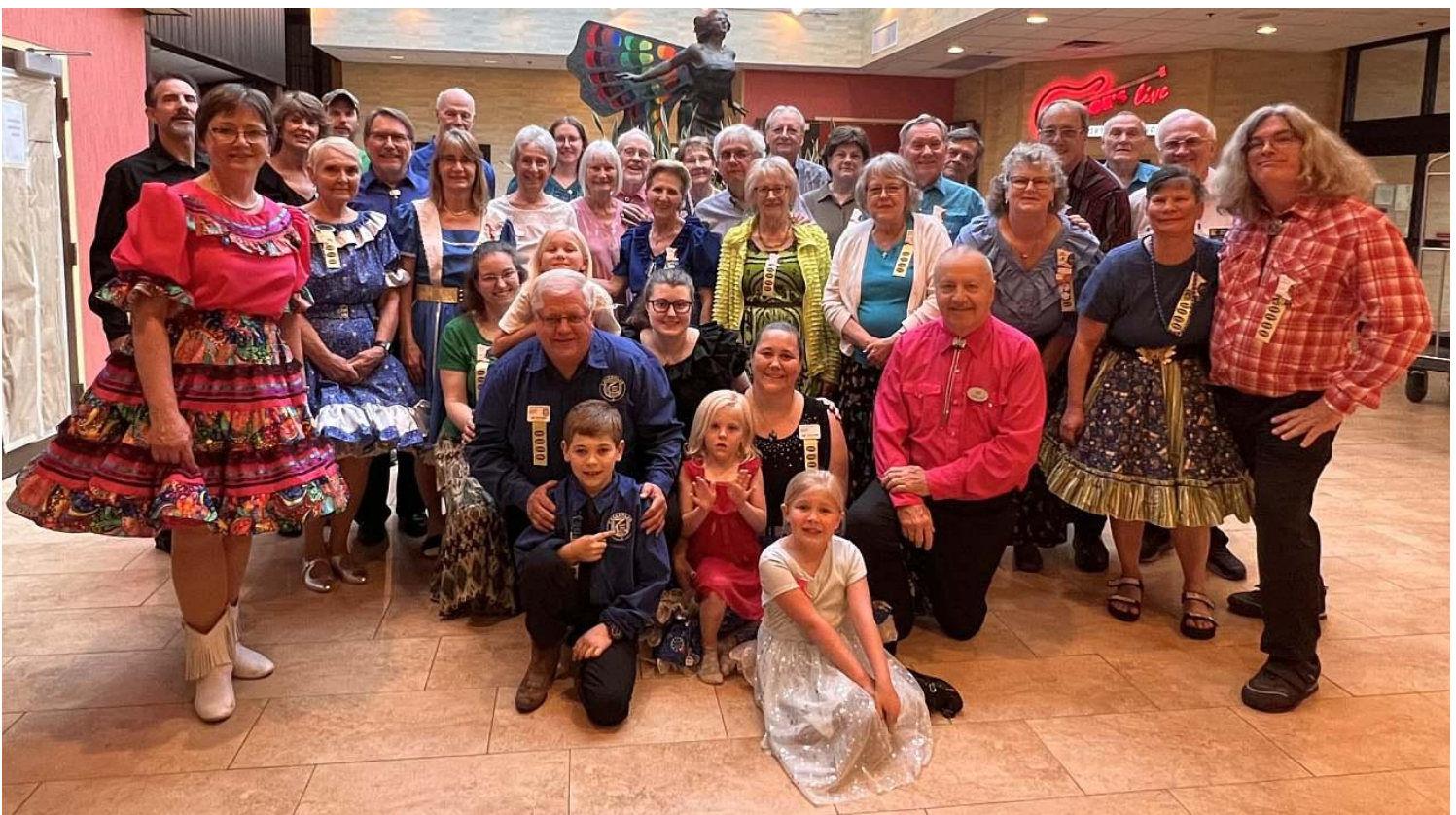
Hotfoot Stompers (mostly) in the Holiday Convention Center lobby