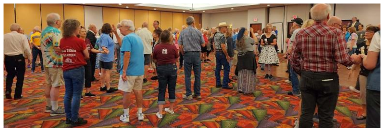
They are so tiny