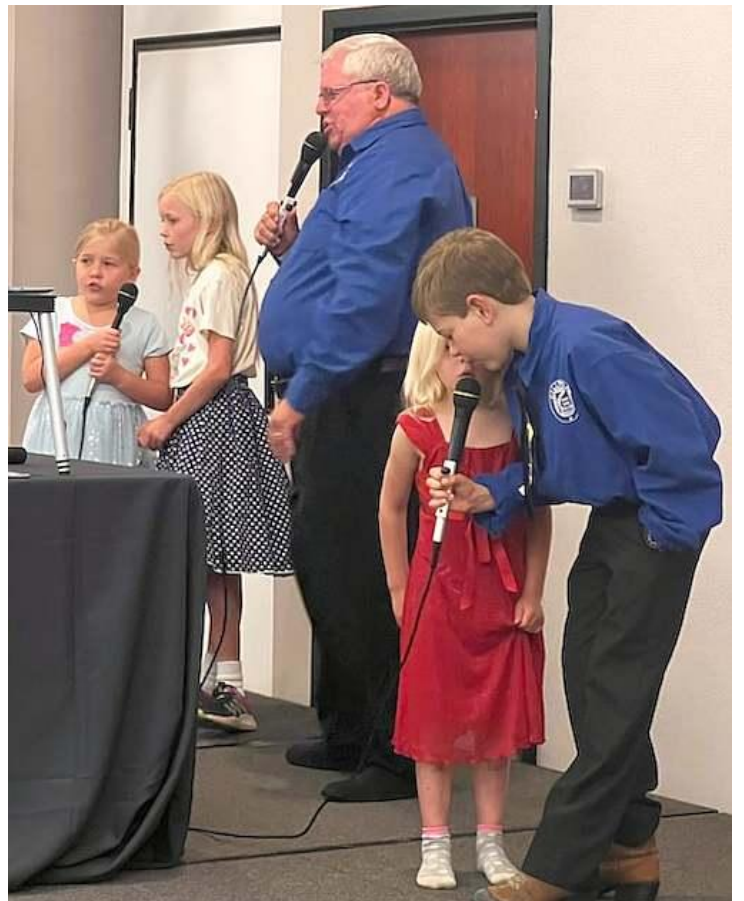
I have a leaning toward family participation :o)