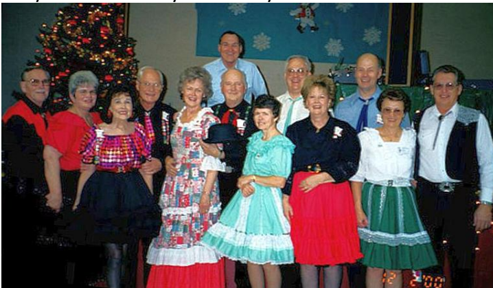
Hotfoot Banner Raid to Dakota Grand Dec 2, 2000