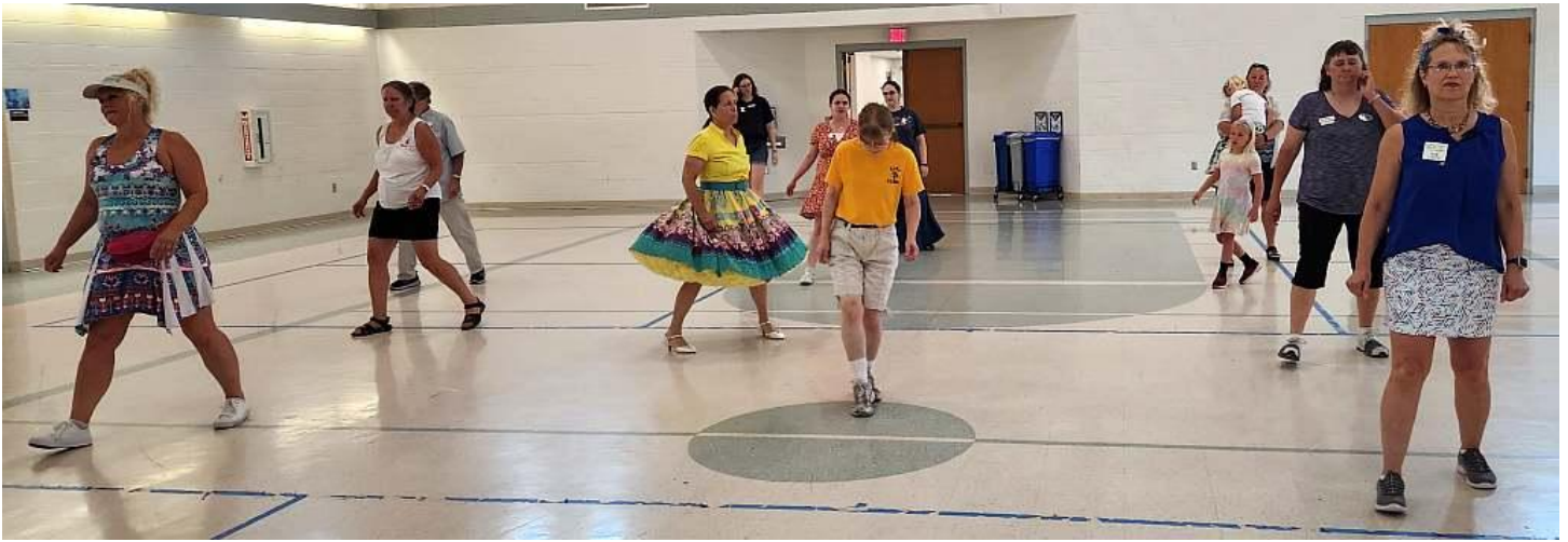
Some line dancing