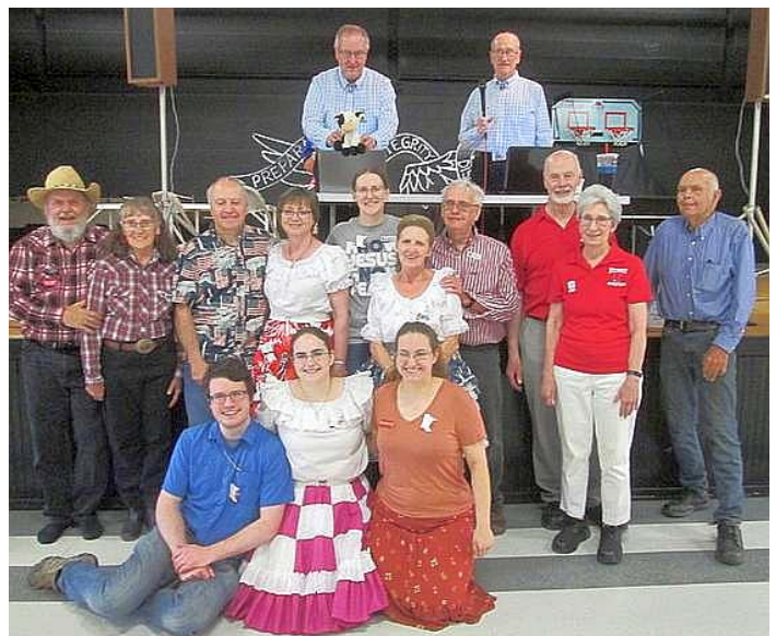
Hotfoot enjoyed calling by the Sprosty Twins July 15