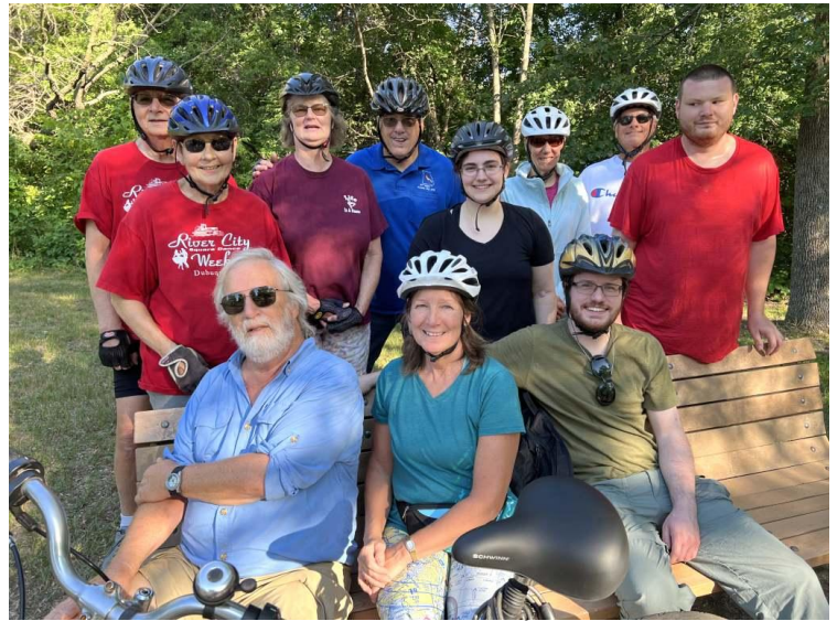
Bikers on the July 6 th ride