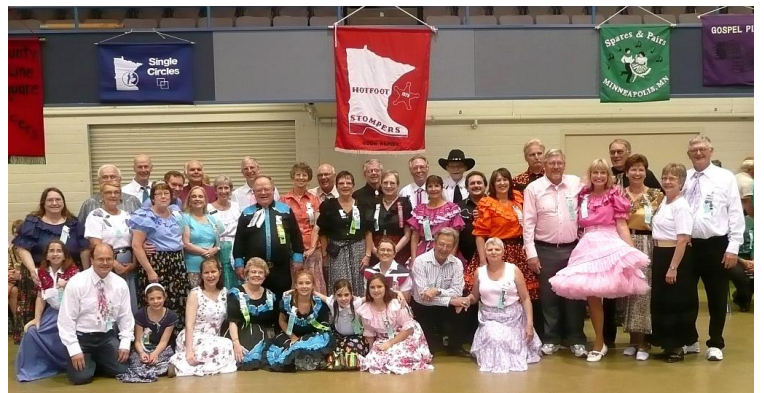
Hotfoot at Mayo Convention Center June 13, 2009