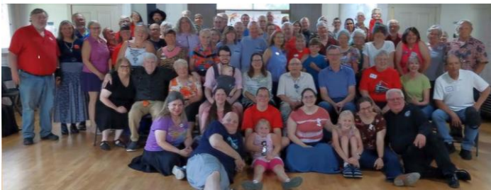
MidSummer Magic dancers