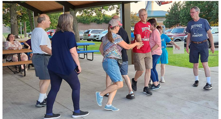
A bit of square dancing in Blaine's Aquatore Park