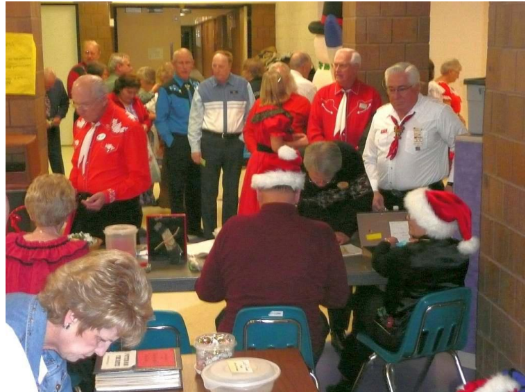
Hotfoot dance intake line on 12-13-2008