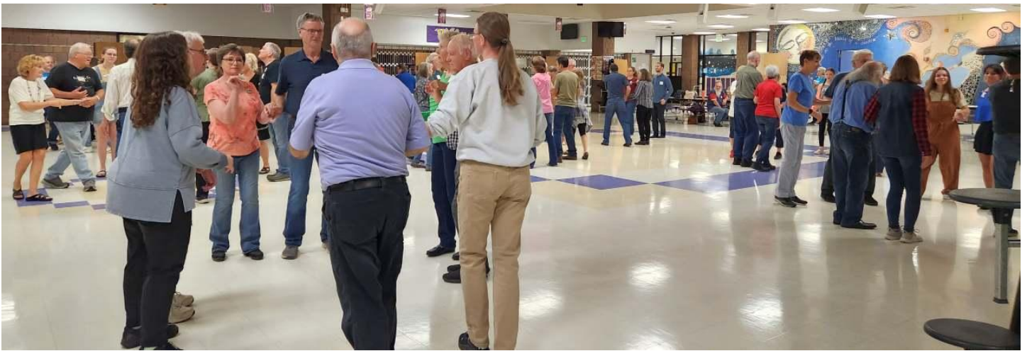
What fun -21 students, 71 angels making Hotfoot's first lesson with 9 squares