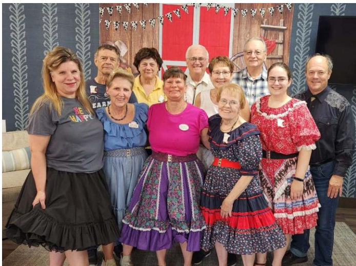
Hotfoot at Harbors Senior Living 9-21-23

entertainment. If you can do just one extra fun thing