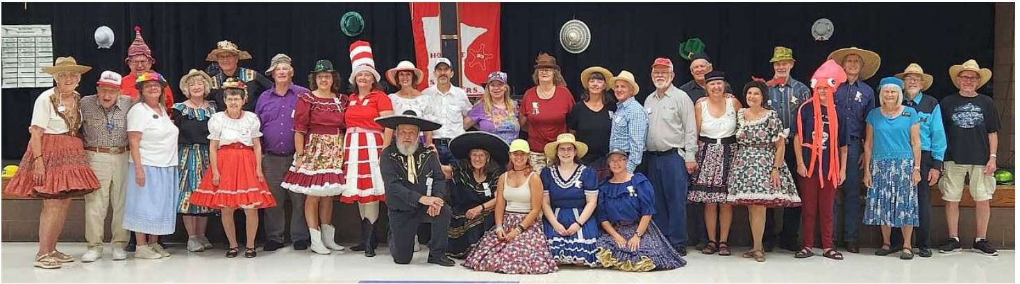
Look at all of those crazy hats