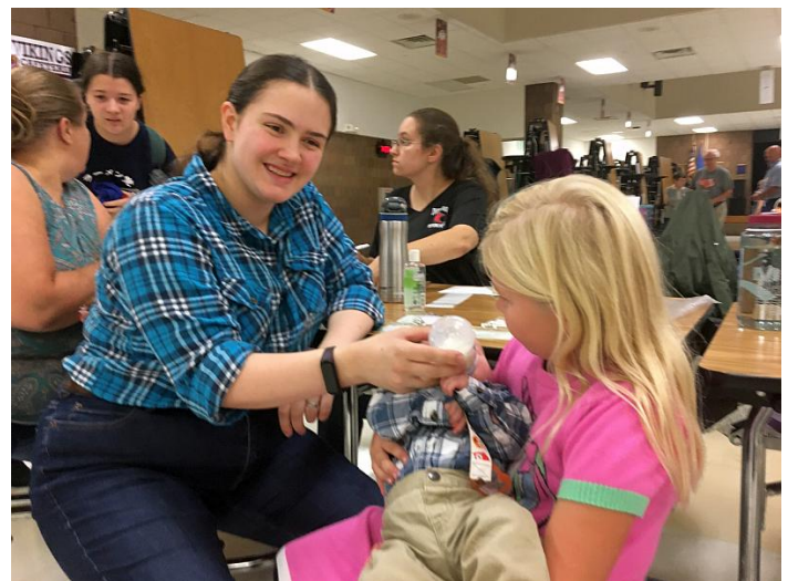
Lessons are more than squaring up 9-25-23