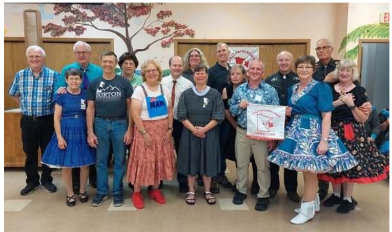
Jolly Promenaders 9-16-23