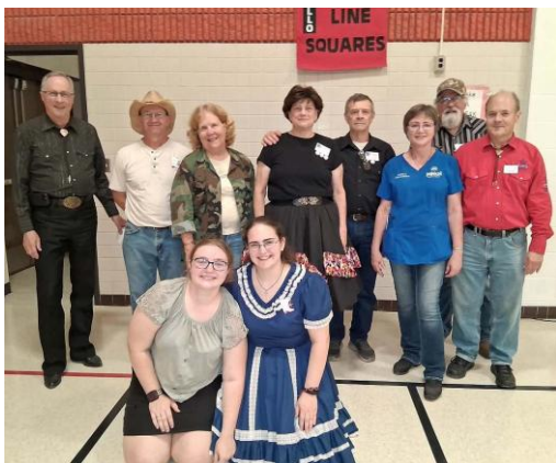
County Line lost a banner to Hotfoot 9-12-25