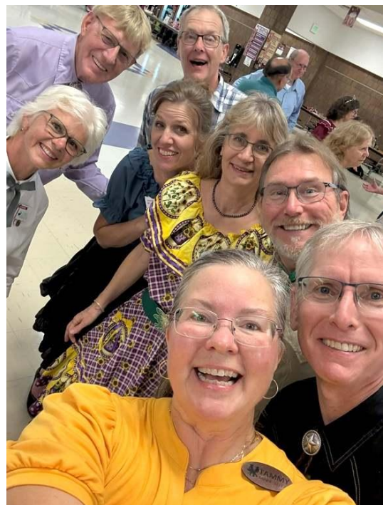
How do we say, we're having fun – with smiles