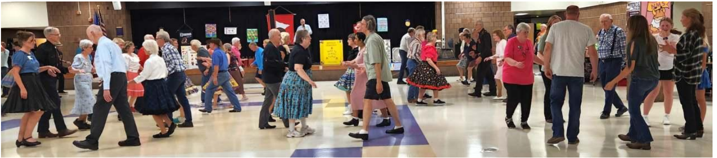
Okay, down to business – square dance time