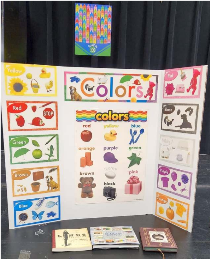
The School Days theme decorations