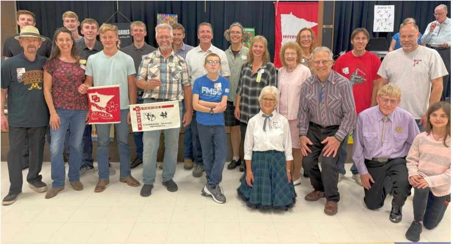
Cambridge Corners takes back their banner and gets a Hotfoot banner