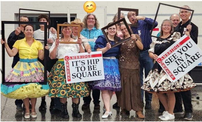
Hotfoot steals Cambridge Corners' banner 9-5-25