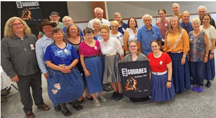
Hotfoot steals B&B's banner 9-6-25