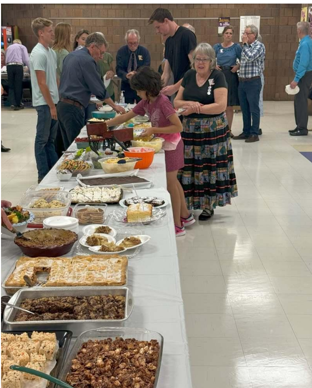
Break for nourishment at the pot luck tables