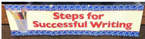
Did someone say class time