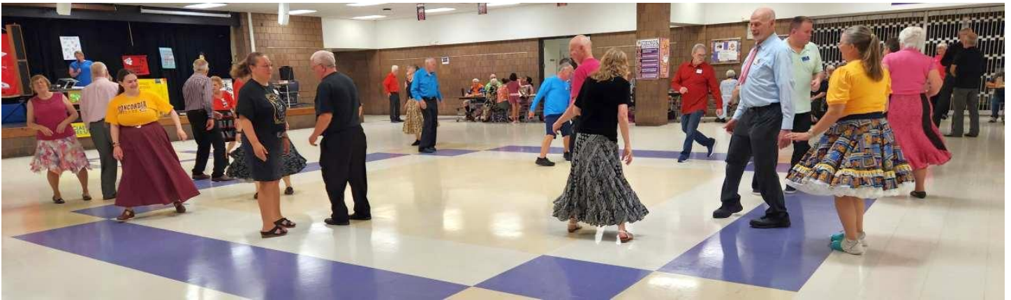
Did someone say "round dance time"