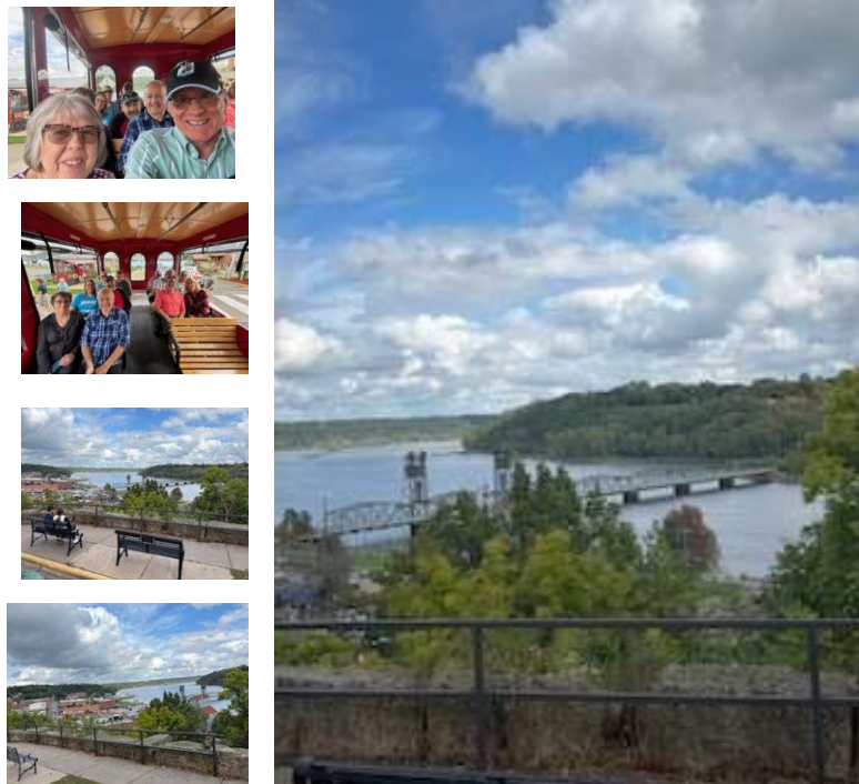
Hotfoot at a social tour in Stillwater, MN on 9-20-25