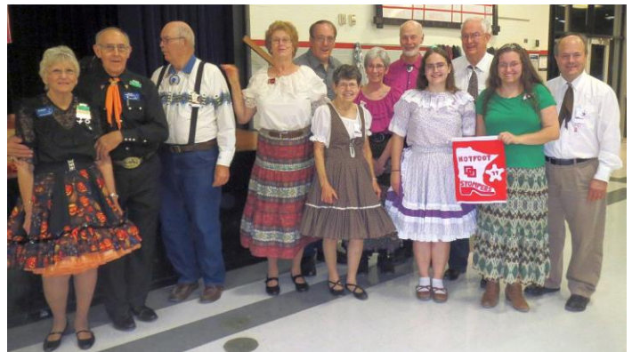
Hotfoot earns our banner back from Westonka Whirlers 10-12-19