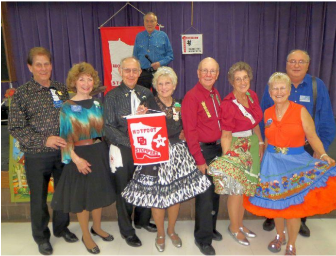
Westonka Whirlers earns a Hotfoot banner