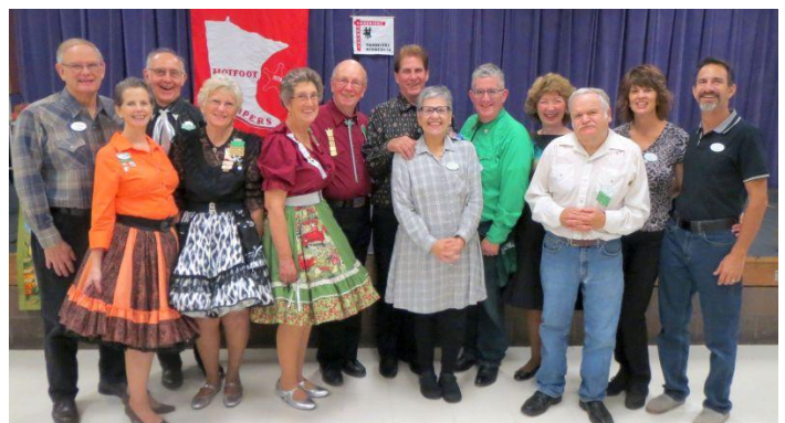
Spares & Pairs earns a Hotfoot Banner