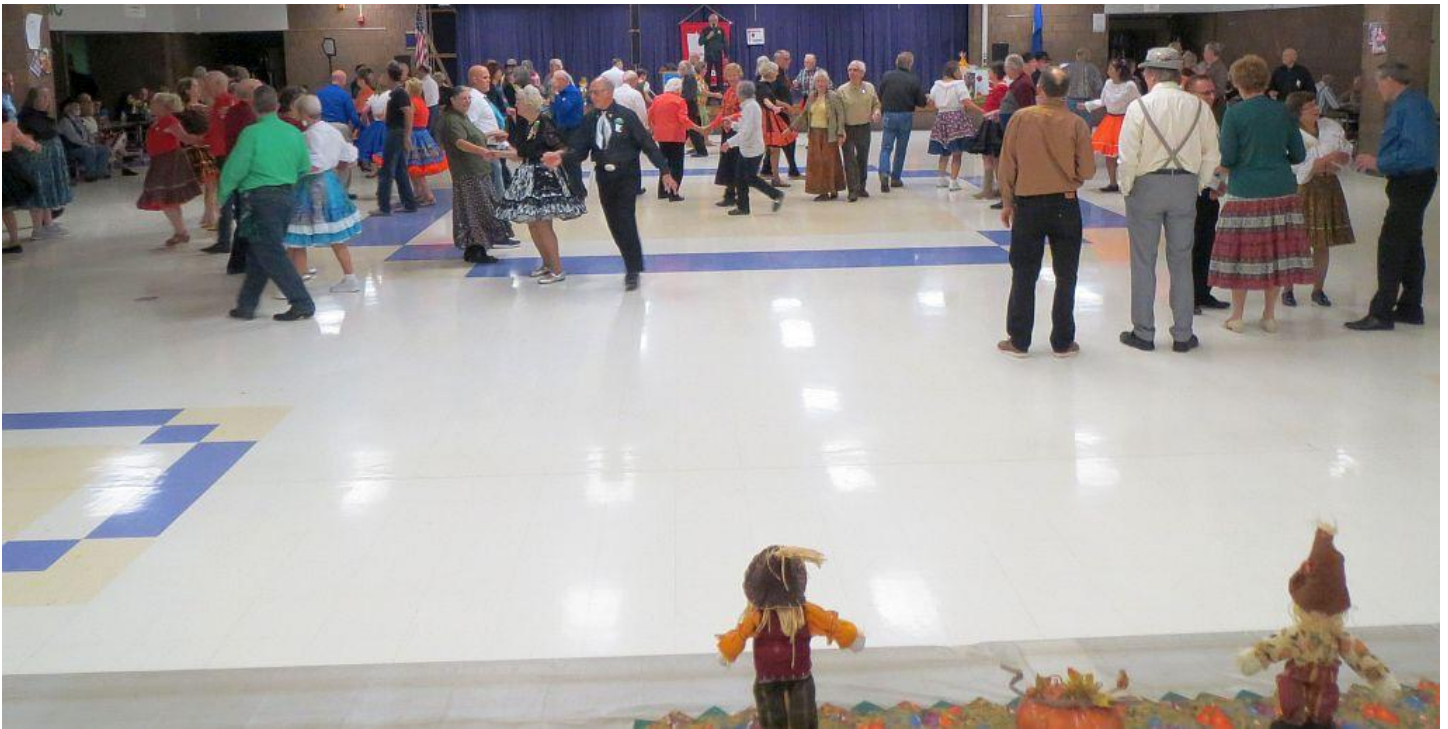
Lots of fun squares from lots of clubs dance to Bob Asp