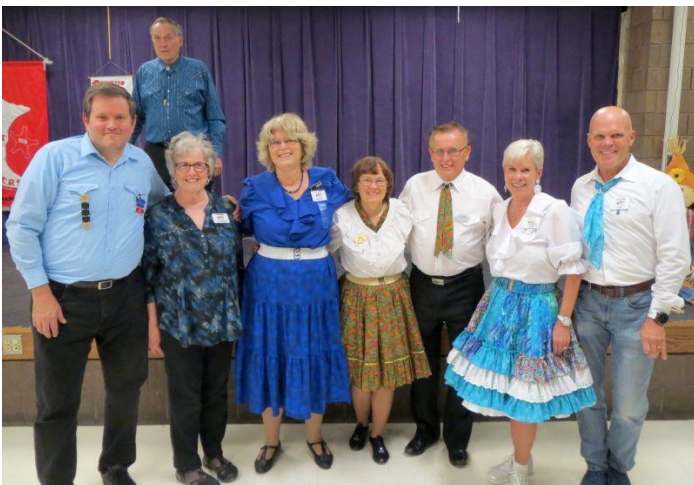
Ar-Dales wins a Hotfoot banner