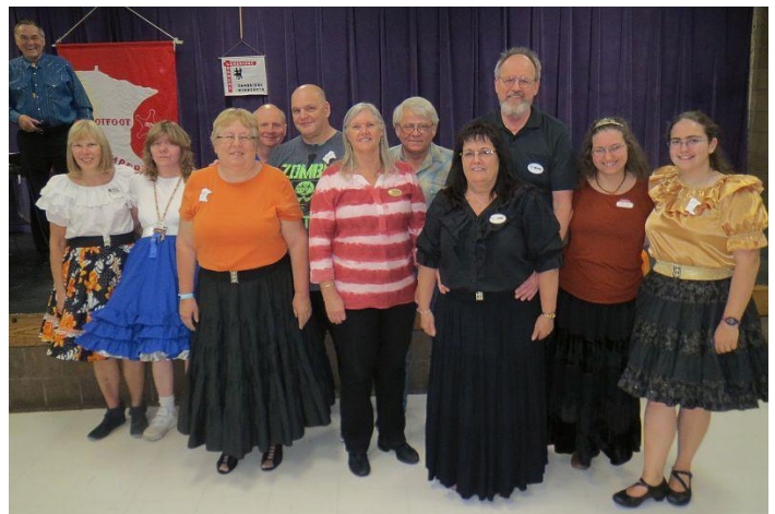
Dans'Pac earns Hotfoot banner but already has one