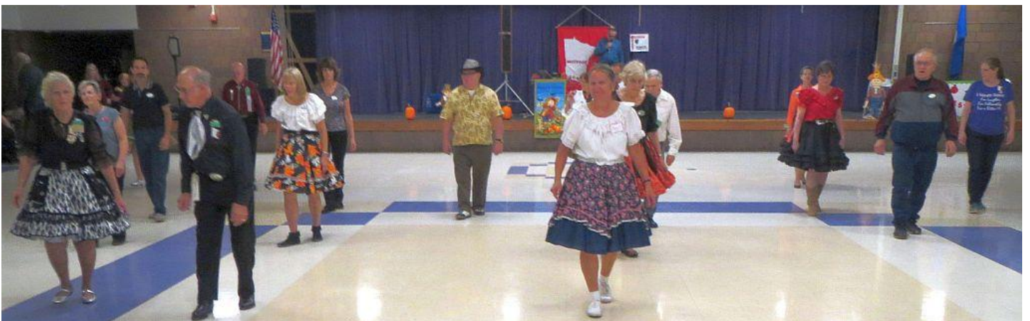
Line dancing was popular, too