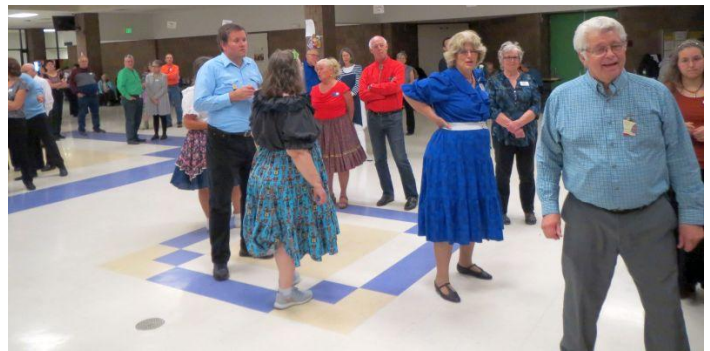
Waiting for a winner during announcements