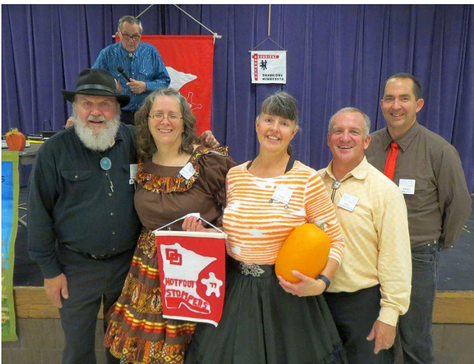
County Line Squares earns a Hotfoot banner (a few left before the picture)