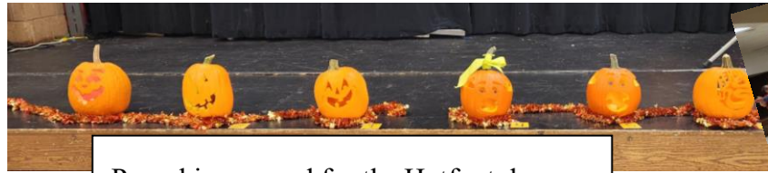
Pumpkins carved for the Hotfoot dance