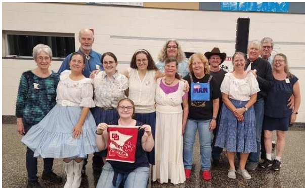
Hotfoot at Cambridge corners for their October dance