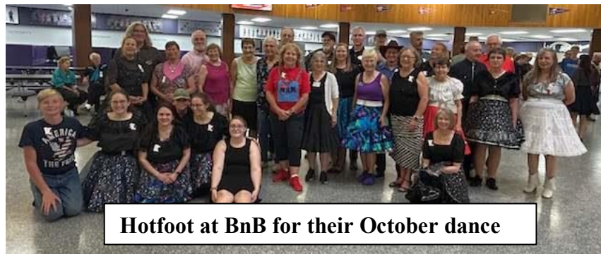
Hotfoot at BnB for their October dance